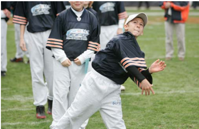
A Punt, Pass and Kick finalist participates in an on-field demonstration prior to the Bears-49ers game.

The Chicago Bears hosted two youth football championship events during the month of November in the Walter Payton Center at the Bears training facility in Lake Forest. The NFL Punt, Pass and Kick Team Championship was held on Saturday, November 12. Qualifying finalists then participated in an on-field demonstration prior to the Bears-49ers game on November 13, and the winners were announced during the game on the video boards in Soldier Field. The Bears also hosted the Chicago Park District's "Bears Inner City Flag Football" championship games on