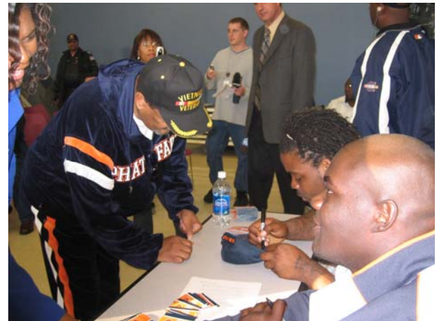
Tommie Harris and Tank Johnson sign autographs for veterans at Jesse Brown VA Medical Center.

Defensive tackles Tommie Harris and Tank Johnson visited the Jesse Brown VA Medical Center in Chicago on Tuesday, November 8 in honor of Veterans' Day. Tommie and Tank participated in a question and answer session before playing a Bears trivia game and signing autographs for approximately 100 veterans who are currently patients at the facility. The Jesse Brown VA Medical Center provides care to over 62,000 veterans who reside in the city of Chicago and Cook County, plus six counties in northwest Indiana.