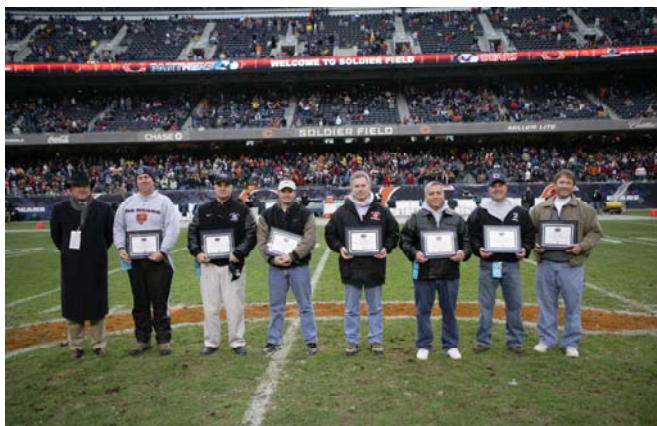
2005 Chicago Bears "Coach of the Week" winners