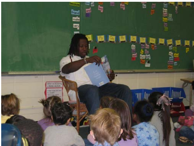
Adrian Peterson read a book to three first grade classes at Lincoln Elementary School in Evanston on Tuesday, November 29.

Saturday, November 19. Children, ages 9-12, who live in public housing have the opportunity to learn and play the game of football through this organized league consisting of 16 teams. For more information on youth football opportunities with the Chicago Bears, please visit www.ChicagoBears.com/community .