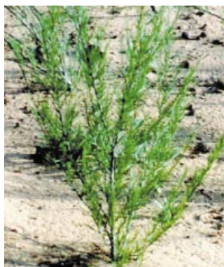
Fig. 1: Rooibos plant

shrub which is indigenous to the North Western Cape of South Africa, in the area of the Cederburg Mountains 1,6 . It is a member of the legume family, Fabaceae. The plants can survive in extreme and nutrient poor conditions because of their very deep tap roots 3,5 . The Rooibos plant is a green shrub that grows between 1.5 and 2 metres high, with fine needle-like leaves (Fig. 1). In fact the name is misleading because neither is it red in its natural habitat, the colour develops later during the fermentation process, nor is it a true tea (from the tea plant Camellia sinensis ).