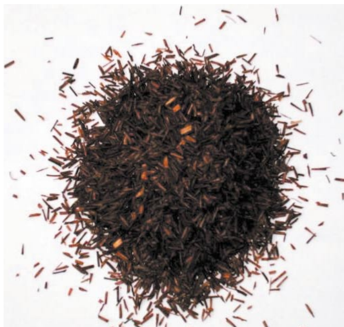
Fig. 2: Rooibos tea, fermented, dried and processed