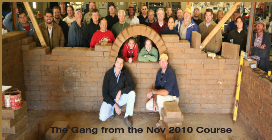
The Gang from the Nov 2010 Course

Students who persevere through all of the sessions through Q. and A. on Saturday afternoon will receive a Certificate of Completion. Class cost includes an Earth Block Construction manual.