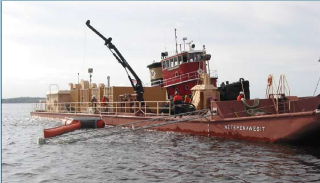
One of the Maine DEP's oil recovery barges is the Netepenawesit (the Indian translation is "He Who Watches"). The barge has its tanks loaded with water and its JBF 500 skimming system deployed.