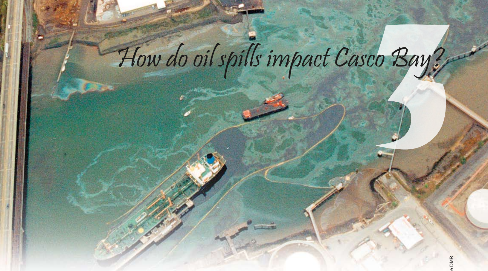
Oil spreading up the Fore River from the Julie N oil tanker spill in September, 1996.