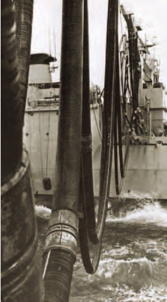
Fuel hoses connect two ship conducting a refueling at sea.