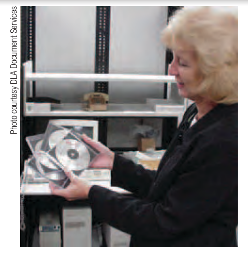
A DLA Document Services team member displays CDs that hold information from Navy aperture cards, which were older data storage systems converted by DLA Document Services.

DLA Document Services today manages more than 150 document-