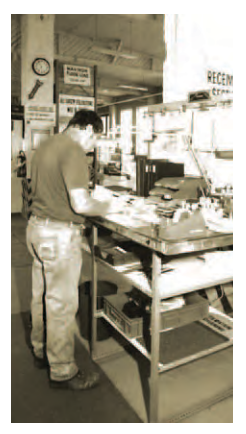
An employee at Defense Reutilization and Marketing Office Berlin works at a receiving desk that saw items totaling an average of $500,000 added to the inventory each month in the 1980s.

The 2010 We Are DLA campaign gave DRMS its new name – DLA Disposition Services – which carries on the original DPDS mission in many ways.