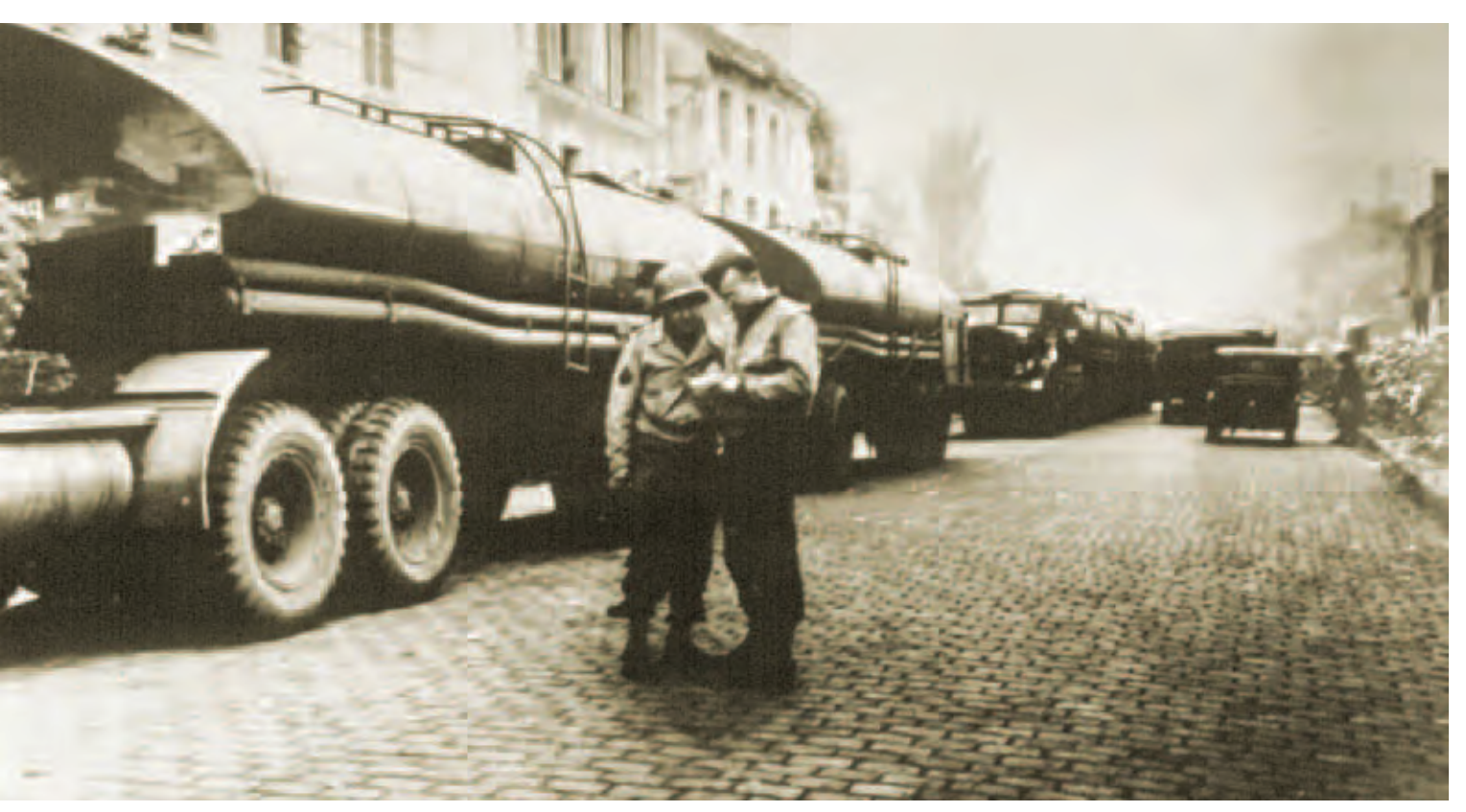
Soldiers in World War II prepare for a fuel convoy. The Army-Navy Petroleum Board, DLA Energy's earliest incarnation, managed petroleum during the war.

DLA was designated the executive agent for bulk petroleum in August 2004, and DESC took on responsibility for the management of all DoD bulk petroleum, with an emphasis on improving efficiency and minimizing duplication and redun-