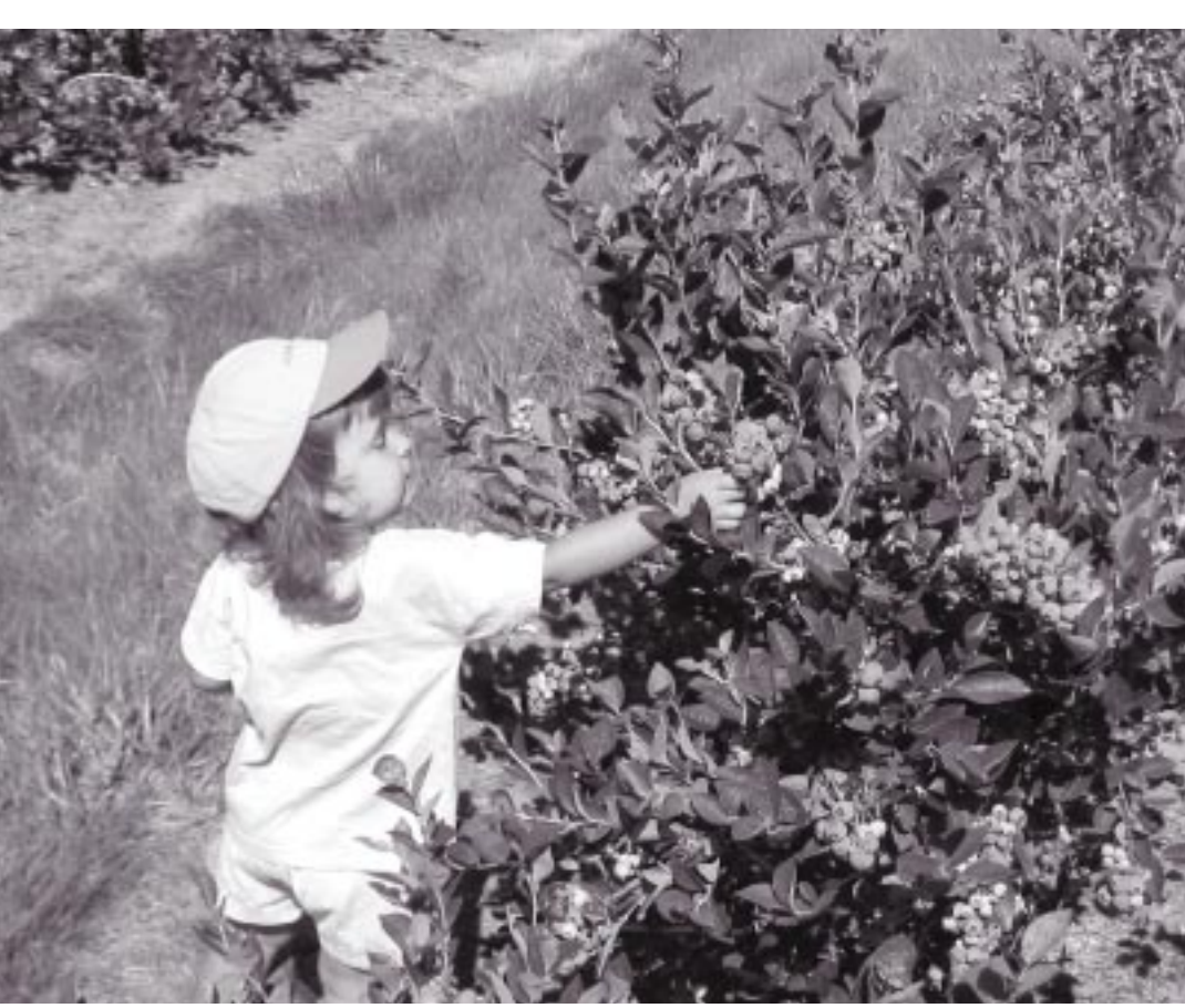
Nova Agri Inc.