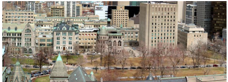
The lower campus green framed by buildings from different periods

Through infill development, building additions and connecting structures, develop contiguous groupings of buildings which frame and support the streets, pathways and open spaces; and which