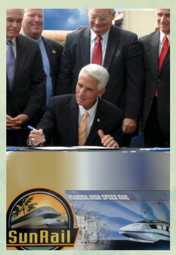
Continues on page 4

The Federal Railroad Administration in January also awarded Central Florida a highly-competitive $1.25 billion grant to begin the final design and construction of a High Speed Rail project that will link Orlando International Airport to the Orange County Convention Center, Walt Disney World, Lakeland and downtown Tampa. Bus service from SunRail's Sand Lake Road station to both Orlando International