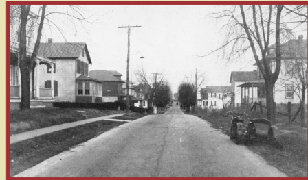
On the eve of annexation in 1929, many of the streets had been paved and lighted, and additional house construction had created a trace town feel to Potomac. Street lighting had been installed in 1910 in the form of forty-five 40-candlepower incandescent lamps. The hard paving of streets began with Mount Vernon Avenue in 1911 and gradually expanded to other streets, although this process was still not complete in 1930. This view shows Hume Avenue from the top of a small ridge, looking east towards Potomac Yard.