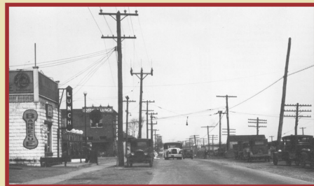
A massive railroad classification yard (for switching and sorting trains) was built in 1904 to the east of Del Ray and St. Elmo, named Potomac Yard. This brought employment to the area, and spurred housing and retail growth. It also brought life to what had been the poorly maintained Washington & Alexandria Turnpike, along the eastern boundary of the Town of Potomac. Here that road is seen about 1930, improved as the Jefferson Davis Highway, with Potomac Yard on the right and the eastern edge of the town on the left.