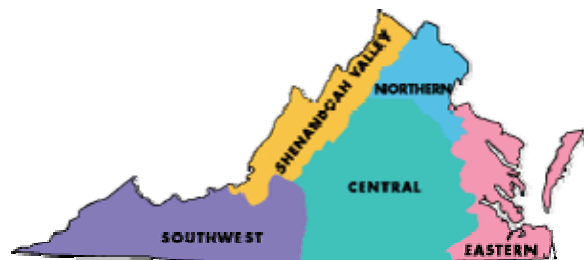
Virginia Major Wine Regions

From these data and analysis, assessments were made and conclusions developed as the overall profitability and viability of Virginia wineries as described in this report.