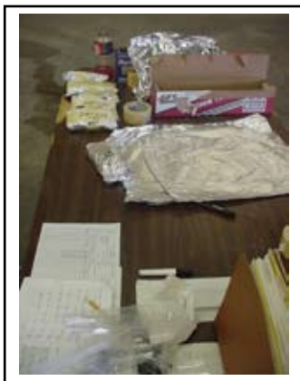
Fish fillets being prepped for testing at the MDCH Lab in Lansing, Michigan.

By using the Michigan Fish Advisory, you can see which fish have been tested for chemicals and are safer for you and your family to eat.