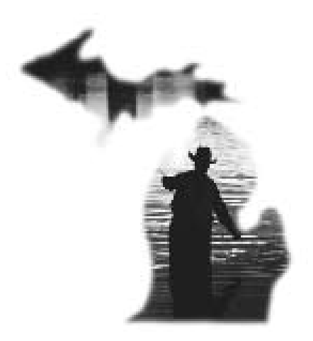
Michigan Department of Community Health