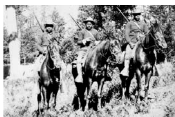
NPS, YOSEMITE RESEARCH LIBRARY

The U.S. went to war with Spain in 1898. Large tent camps spread across the Presidio as troops awaited shipment to the Philippines during this short war and the following Philippine War. Returning sick and wounded were treated in the Army's first permanent general hospital, later named Letterman.