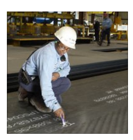
SSAB's North American Division is the number one supplier of plate in the U.S. and Canada.

A $200 million expansion is currently underway at the State Docks.