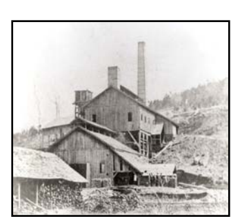
The Irondale Furnace in 1865 was the first to be rebuilt after the Civil War.

During the last two years of the Civil War, 70% of the entire South's iron supply was produced by Alabama furnaces. Twelve locations became the target of federal cavalry raids as well as the Selma Gun Works and Arsenal.