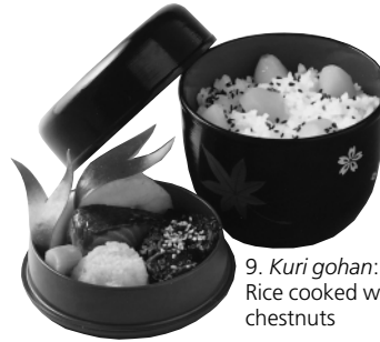
9. Kuri gohan : Rice cooked with chestnuts