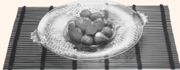
11. Ichigo : Strawberries