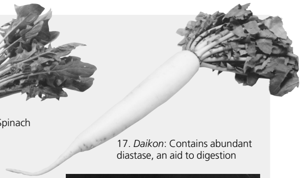
17. Daikon : Contains abundant diastase, an aid to digestion