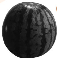
14. Suika : Watermelon