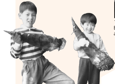
12. Takenoko : Bamboo shoots