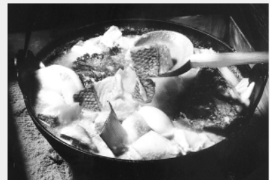
19. Nabe : Hot pot combining fish and vegetables in season warms you to the core