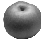
8. Nashi : Crispier and juicier than a Western pear