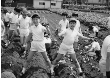
5. Satsuma-imo dig

Absorbing the nutrients of the earth throughout the summer, vegetables— satsuma-imo (sweet potato), sato-imo (taro potatoes), carrots—also arrive at harvest time in autumn. One of the regular excursions of the kindergarten, day care center, and elementary school year is the satsuma-imo dig when the children go themselves to un-earth sweet potatoes grown in nearby fields.