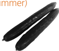
15. Kyūri : Japanese cucumbers