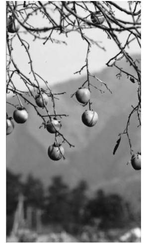
10. Kaki : Japanese persimmons are sweet and crispy and ripen before frost.