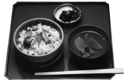
2. An autumn meal