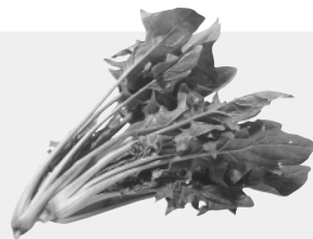
16. Hōrensō : Spinach