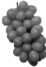
7. Budō : Grapes