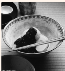
13. Wakatake-ni : Boiled wakame kelp and bamboo shoots