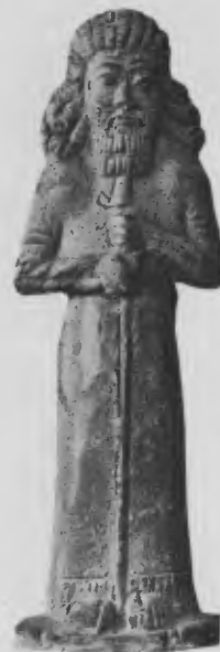
Terra-cotta figure of a god. From a foundation deposit at Babylon.