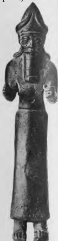
Bronze figure of a Babylonian god. [No. 91,147.]

[The remainder of the text is fragmentary, and shows that the text formed part of an incantation which was recited in the Temple of E-Zida, possibly the great temple of Nabû at Borsippa.]