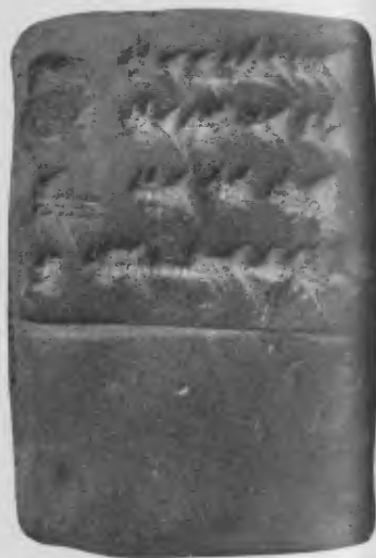
Tablet inscribed with a list of the Signs of the Zodiac. [No. 77,821.]

possessed lists of the fixed stars, and drew up tables of the times of their heliacal risings. Such lists were probably based upon very ancient documents, and prove that the astral element in Babylonian religion was very considerable.