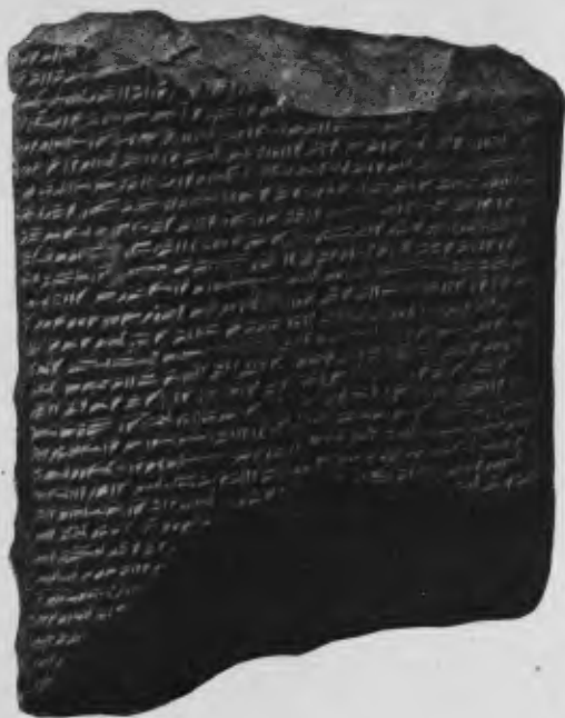
Portion of a tablet inscribed in Assyrian with a text of the Seventh Tablet of the Creation Series. [K. 8522.]