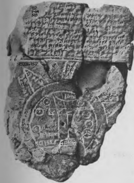
Babylonian map of the world, showing the ocean surrounding the world and marking the position of Babylon on the Euphrates as its centre. It shows also the mountains at the source of the river, the land of Assyria, Bit-Iakinu, and the swamps at the mouth of the Euphrates.

versions of the Legend of the Creation, the works of Babylonian and Assyrian editors of different periods, must have existed in early Mesopotamian Libraries. King's edition