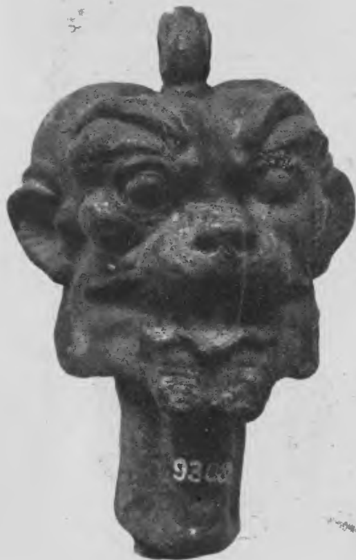
Babylonian Demon. [No. 93,089.]

"There was a time in which there existed nothing but darkness and an abyss of waters, wherein resided most hideous beings, which were produced on a two-fold principle. There appeared men, some of whom were furnished with two wings, others with four, and with