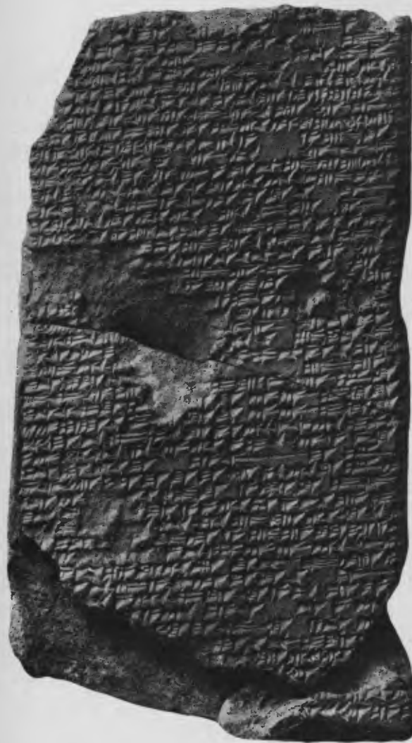
Portion of a tablet inscribed in Assyrian with a text of the Fourth Tablet of the Creation Series. [K. 3437.]