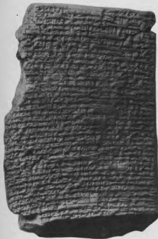
Portion of a tablet inscribed in Assyrian with a text of the Second Tablet of the Creation Series. [No. 40,559.]