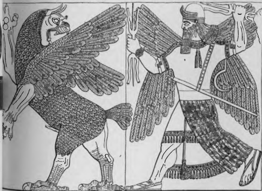
between Marduk (Bel) and the Dragon. Drawn from a bas-relief from the Palace of Ashur-nasir-pal, King of Assyria, 885-860 B.C., at Nimrûd. [Nimrûd Gallery, Nos. 28 and 29.]

In the consultation which took place between APSÛ and TIĀMAT, their messenger MU-UM-MU \rightarrow\text{†} \text{E}^{\text{E}}\text{E}^{\text{E}} \text{E}^{\text{E}} took part; of the history and attributes of this last-named god nothing is known. The result of the consultation was that a long struggle began between the demons and the gods, and it is clear that the object of the powers of darkness was to destroy the light. The whole story of this struggle is the subject of the Seven Tablets of Creation. The gods are deifications of the sun, moon, planets and other stars, and APSÛ, or CHAOS, and his companions the demons, are personifications of darkness, night and evil. The story of the fight between them is nothing more nor less than a picturesque allegory of natural phenomena. Similar descriptions are found in the literatures of other primitive nations, and the story of the great fight between Her-ur, the great god of heaven, and Set, the great captain of the hosts of darkness, may be quoted as an example. Set regarded the "order"