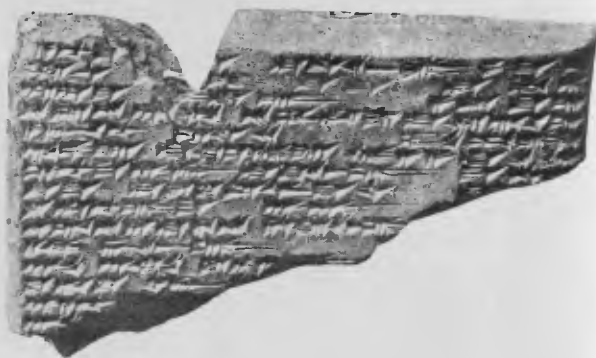
Portion of a tablet inscribed in Assyrian with a text of the First Tablet of the Creation Series. [K. 5419c.]