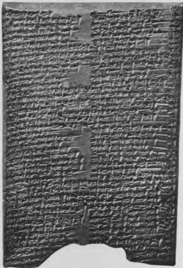
Portion of a tablet inscribed in Babylonian with a text of the Fourth Tablet of the Creation Series. [No. 93,016.]