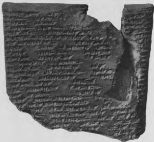
Portion of a tablet inscribed in Assyrian with a text of the Fifth Tablet of the Creation Series. [K. 3567.]