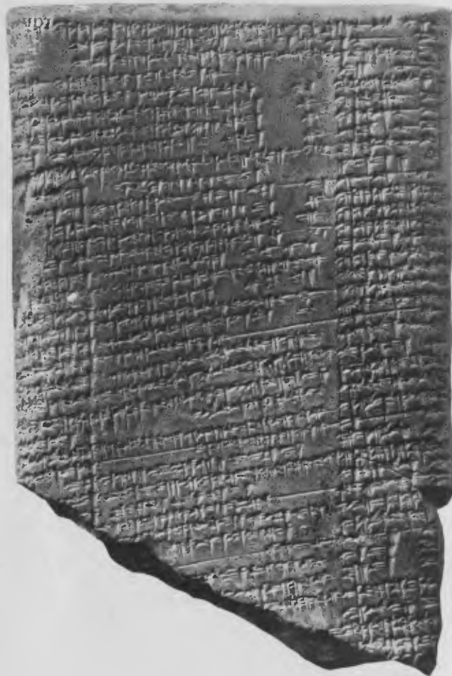
The Bilingual Version of the Creation Legend. [No. 93,014.]