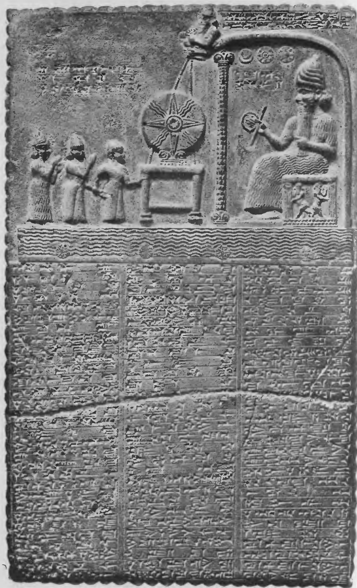
Tablet sculptured with a scene representing the worship of the Sun-god in the Temple of Sippar. The Sun-god is seated on a throne within a pavilion holding in one hand a disk and bar which (like \odot in Egyptian) may symbolize eternity. Above his head are the three symbols of the Moon, the Sun, and the planet Venus. On a stand in front of the pavilion rests the disk of the Sun, which is held in position by ropes grasped in the hands of two divine beings who are supported by the roof of the pavilion. The pavilion of the Sun-god stands on the Celestial Ocean, and the four small disks indicate either the four cardinal points or the tops of the pillars of the heavens. The three figures in front of the disk represent the high priest of Shamash, the king (Nabu-aplu-iddina, about 870 B.C.) and an attendant goddess.