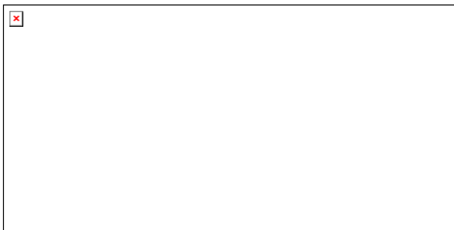
Fig.2. Percentages of Egypt's population distribution

Although Egypt owns the Nubian Aquifer, which is considered as a huge underground water reservoir, human activities and land use developments still depend on the Nile water availability. This is mainly because of the non-suitability of underground water for agriculture, and even for municipal purposes. Another factor which links the country development with the Nile freshwater availability is the population growth rate and the limited inhabited area of the vast Egyptian territory. As a matter of fact the Egyptian territory covers an area of about one million square kilometers. However, the Nile morphology and the barren deserts that bound the Nile valley and delta constitute a geographical barrier that prevents Egyptians from fully utilizing their territories. That is why about 99% of the population (total = 67 millions) is concentrated in 5.5% of the country area mainly located in the Nile valley and delta (Fig 2).