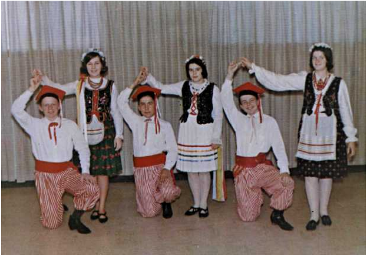
POLISH DANCE — "KRAKOWIAK"