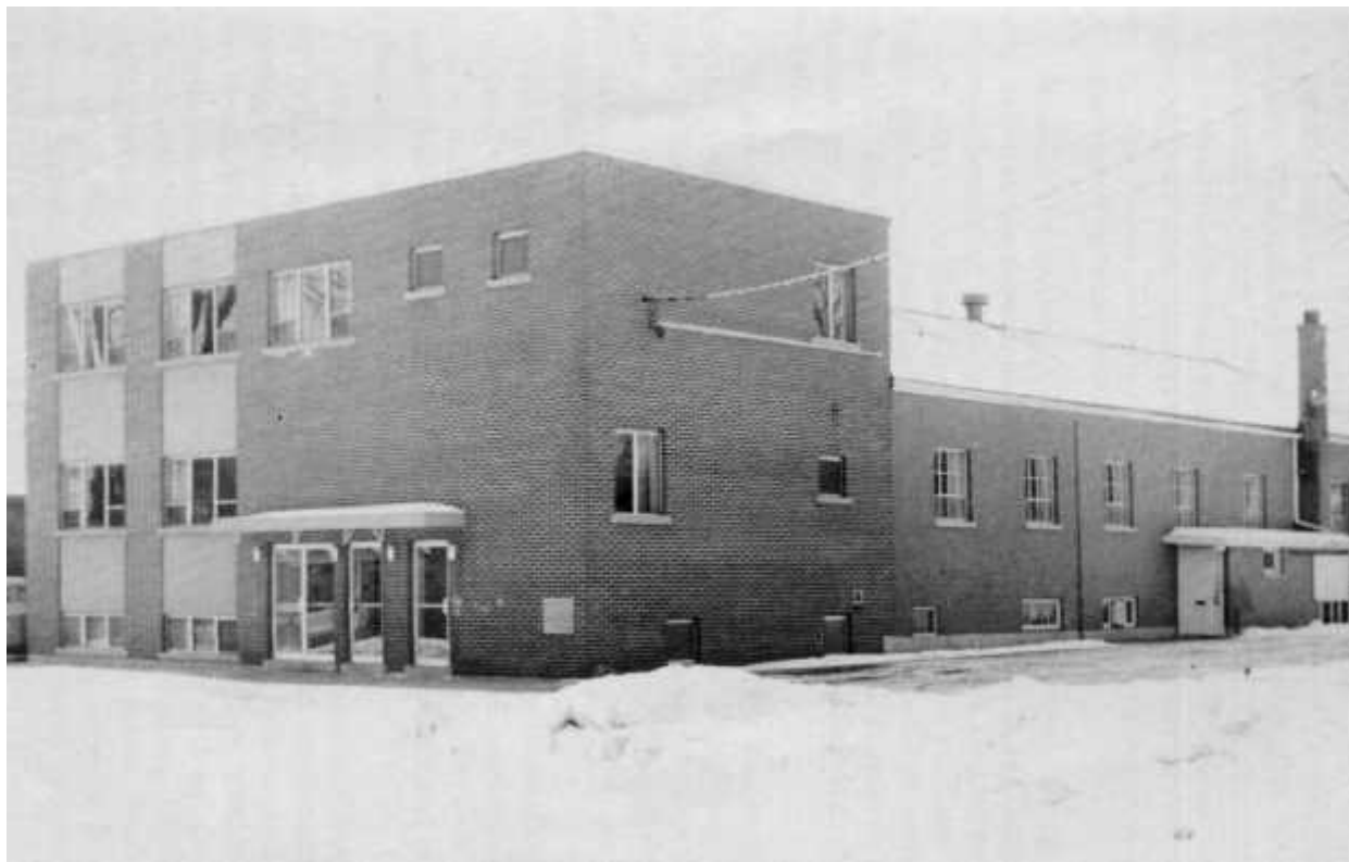
POLISH MUTUAL BENEFIT & FRIENDLY SOCIETY 154 Pearl Street, Brantford "HALL"