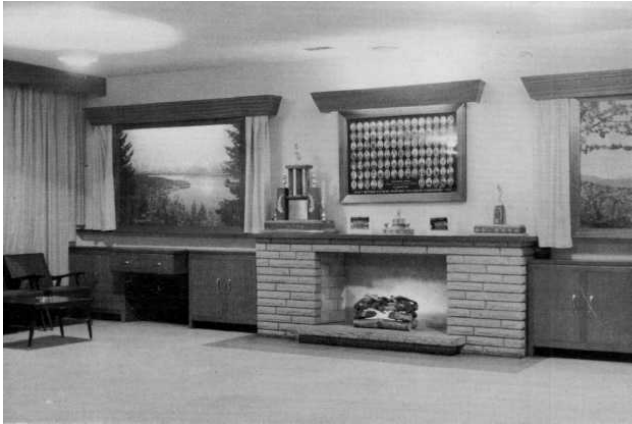
POLONAISE VETERANS CLUB ROOM 154 Pearl Street