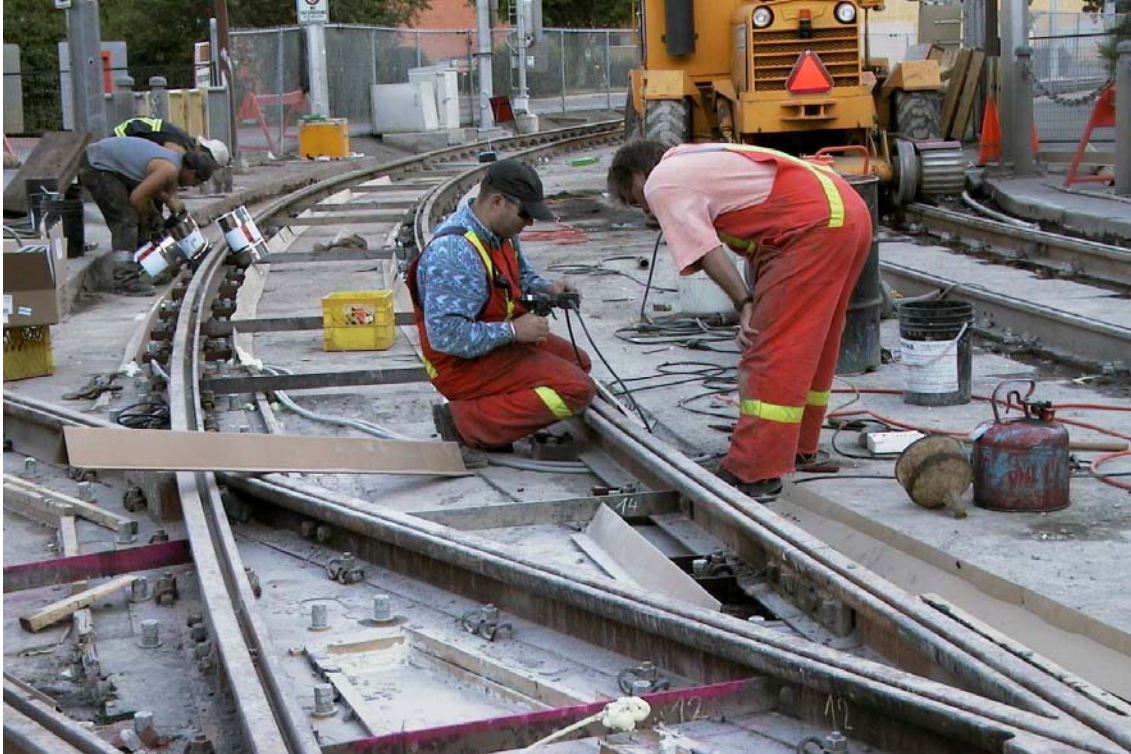
Figure 7 - Calgary Transit LRT Staff Replacing Trackwork

Traction power and signals are supplied and installed by other City of Calgary departments. Use of in-house expertise permits the establishment of partner relationships and service agreements. This allows other departments to take ownership of various aspects of system construction and maintenance while maximizing the City's investment in staff training, expertise and equipment.