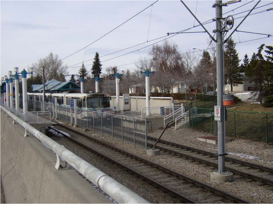
Figure 3 - Community Station – Banff Trail NW Line