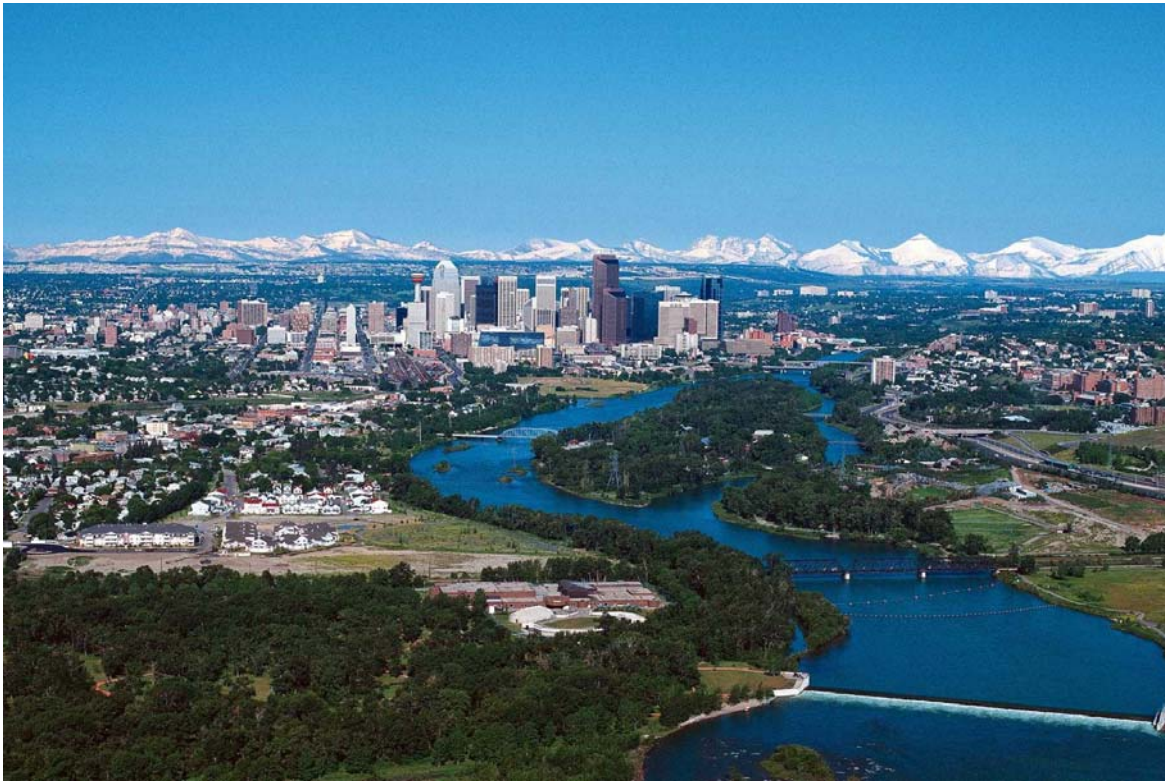
Figure 1 - Calgary Skyline

Calgary is a city of nearly one million people situated in the Rocky Mountain foothills of southern Alberta. The foundation of Calgary's economy is agriculture, energy and tourism. Today, Calgary is home to the second highest concentration of corporate head offices in Canada representing finance, oil and gas, transportation and manufacturing industries.