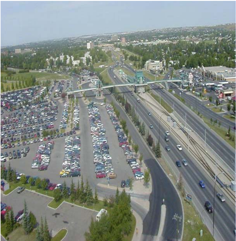
Figure 4 – Brentwood Station with Park & Ride in Expressway Median