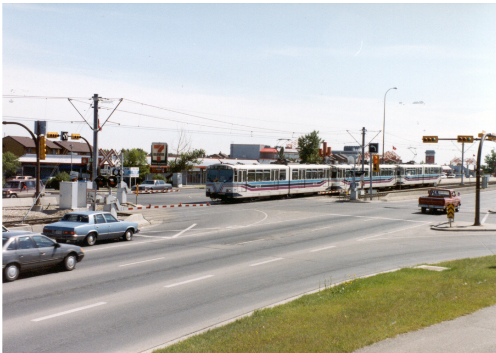
Figure 6 - Suburban Roadway Crossing