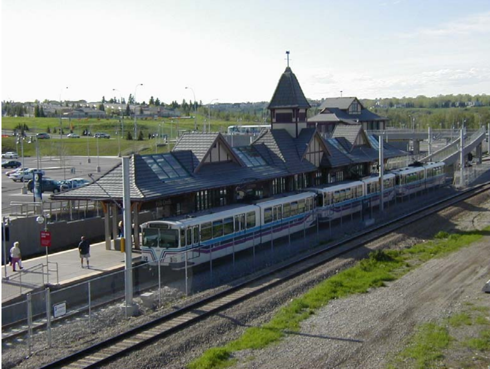
Figure 8 - New Fish Creek Lacombe Station on South Line in Railway Right of Way

A process of community involvement is used in new station design. Urban design and architectural principles have been used to integrate LRT within community and business areas. Involving citizens and business owners in this process enables the local community to express their needs and influence facility design. This process is critical to addressing and resolving local uncertainty and opposition. However, care must be taken to manage this process otherwise costs can escalate when unnecessary frills are allowed to creep into the designs.