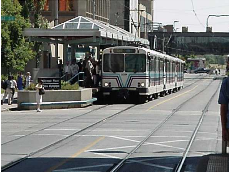
Figure 5- Downtown Platform on 7 Avenue

In the downtown, LRT operates on the 7 th Avenue transit mall that is shared with buses and emergency vehicles. The 11 downtown stations are simple side loading platforms located next to the sidewalk in the curb lane with LRT tracks located in the centre lanes (see Figure 5). Downtown platforms are spaced about every other block alternating between eastbound and westbound stops. Train operation in the downtown is governed by traffic signals that are optimized to allow LRT to travel between stations without stopping.