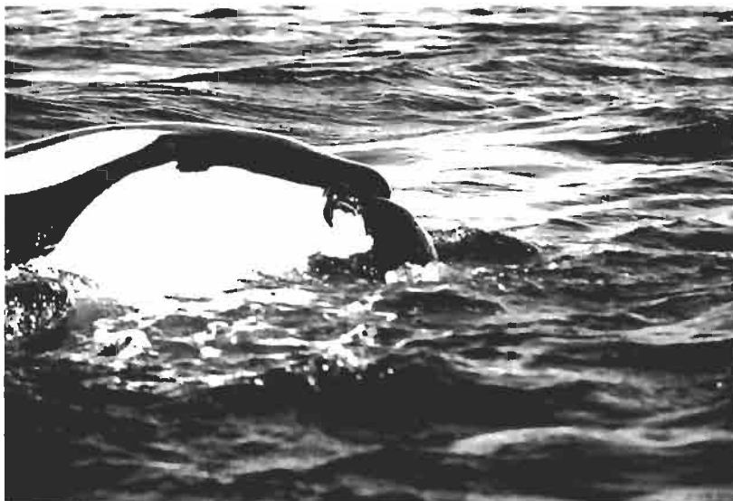
Fig. 3. Transient Killer Whale with live Harbour Seal pup in mouth, off southern Vancouver Island, British Columbia, Canada.