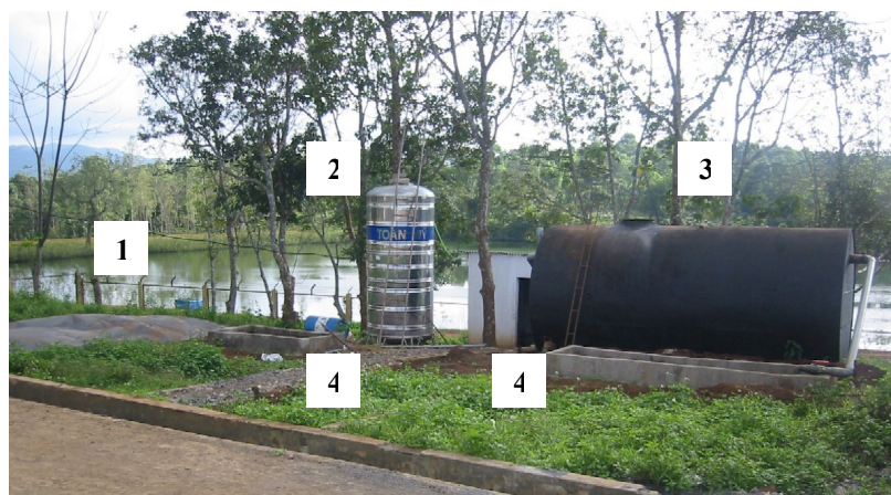
Biogas installations with gas bag (1), digester (2), neutralisation (3) and settlement tanks (4)

Presently, a pilot biogas plant is in place which will reduce up to 90% of BOD content and deliver up to 1 litre methane per litre neutralised waste water. However, to make good biogas at a low pH of 6.1 of waste water, a special strain of methanogenic bacteria, developed especially for the Khe Sanh project, to metabolise calcium acetate, is needed. The methane