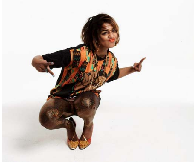
Figure 2 ( www.miauk.com )

M.I.A.'s style is outrageously (but very consciously) eccentric, deriving from various sources. Her stylistic approach seems to have evolved out of distinctly postmodern attitudes. David Muggleton references the words of Jameson saying postmodern style is "schizophrenic," (Muggleton, 36) further applying this to the fashion of post-subcultures focusing on "aesthetic play, hedonism, pleasure and spectacle." (Muggleton, 38) For youth this means that style is no longer bounded by the constraints of a single "uniform" and the "contradictions between their selected subcultural identities, [since] there are no rules, there is no authenticity, no ideological commitment, merely a stylistic game to be played." (Muggleton, 47) M.I.A.'s style is built upon such a playful combination of baggy t-shirts, leggings and short-shorts, incorporating eccentric accessories all bedazzled in bold patterns, sparkle and over-saturated neon color. (See Figure 2) Once kitschy, this style now dictates the trends of her subcultural audience. Additionally, her webpage ( http://miauk.com ) flashes with colorful graphics in an almost seizure-inducing manner perpetuating this stylistic image. M.I.A. consciously references the baggy clothing and eccentric accessories of hip hop and day-glo, outrageously patterned clothes of rave cultures. She has