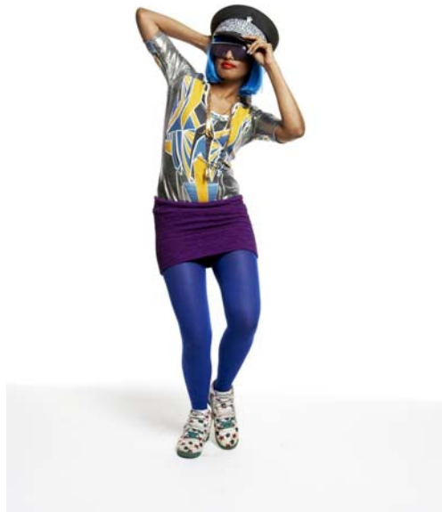
Figure 4 ( www.miauk.com )

However, this does not eliminate the possibility of “choos[ing] a costume and stick[ing] to it—at least for a short while.” (Sweetman, 91)