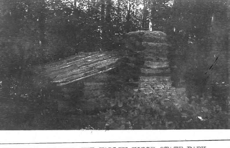
RESTORED SOLDIER HUT VALLEY FORGE STATE PARK