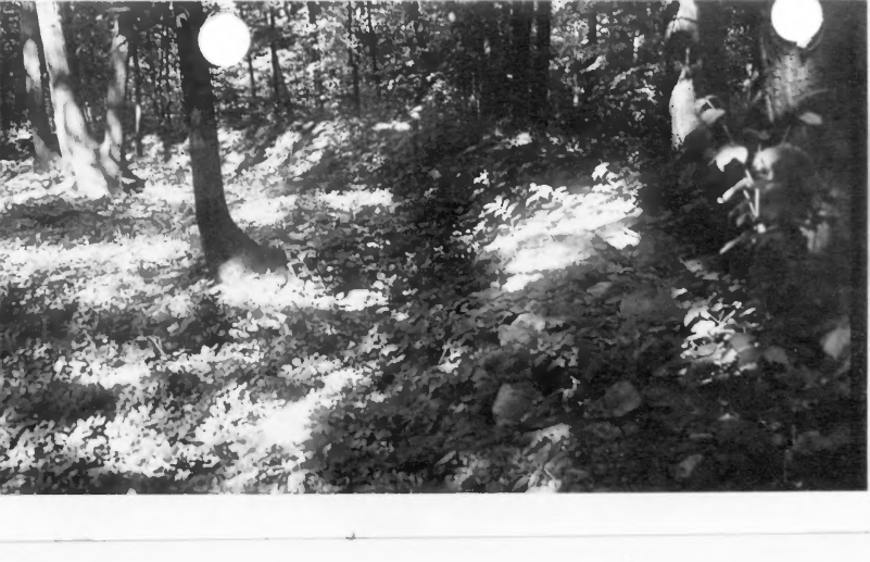
OLD STONE BREASTWORK VALLEY FORGE STATE PARK