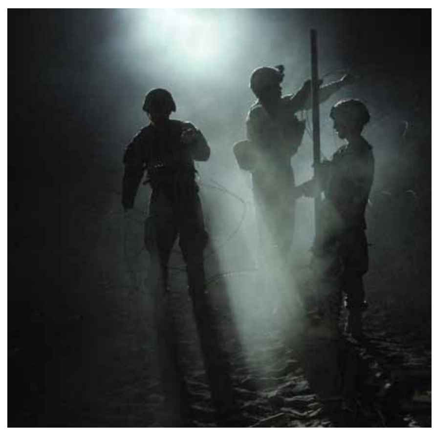
Last Summer, PEO Soldier, working with the Rapid Equipping Force looked at how to reduce weight at every level @ DoD

Gen. Fuller said, "The challenge that we are having is that when we look at a soldier, we don't seem to have a standard configuration. When we were in Afghanistan, we took a squad to one side who were getting ready to do a three day mission and weighed everything that they had. Specialists such as medics were carrying about 140lbs of kit, not only their personal gear, but their survivability, lethality and operating gear too. A mortar man, just carrying couple of mortar rounds and all their other kit was about 125-130lbs. We are looking at anything we can