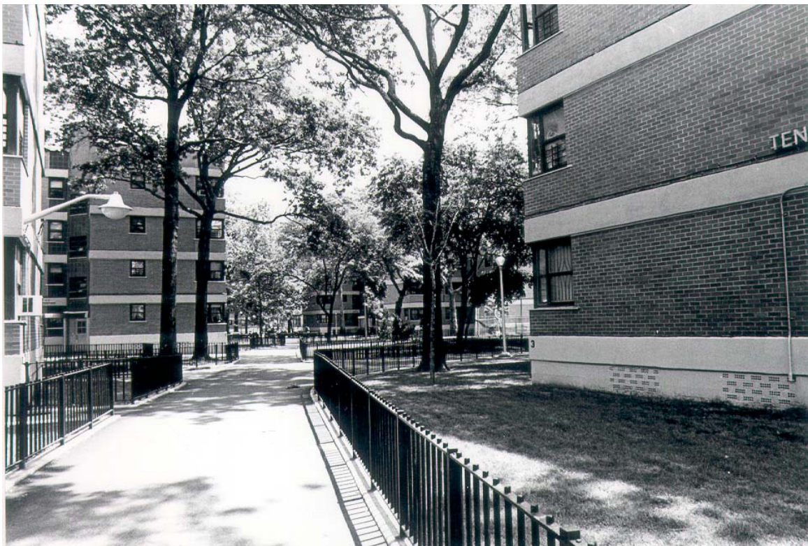
Williamsburg Houses Ten Eyck Walk, looking east