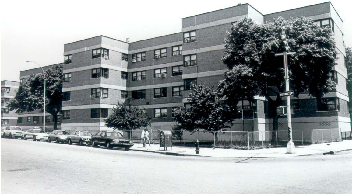
Williamsburg Houses Leonard Street, at Scholes Street (Building No. 5)