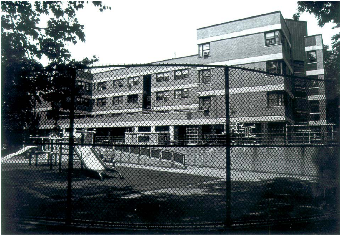
Willamsburg Houses Nursery school and play area South façade of Building No. 11, between Stagg and Ten Eyck Walk