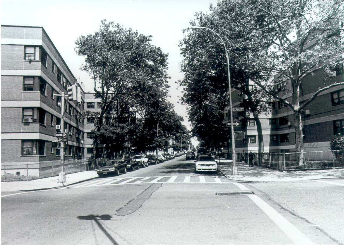
Williamsburg Houses Intersection of Humboldt Street and Scholes Street, looking north