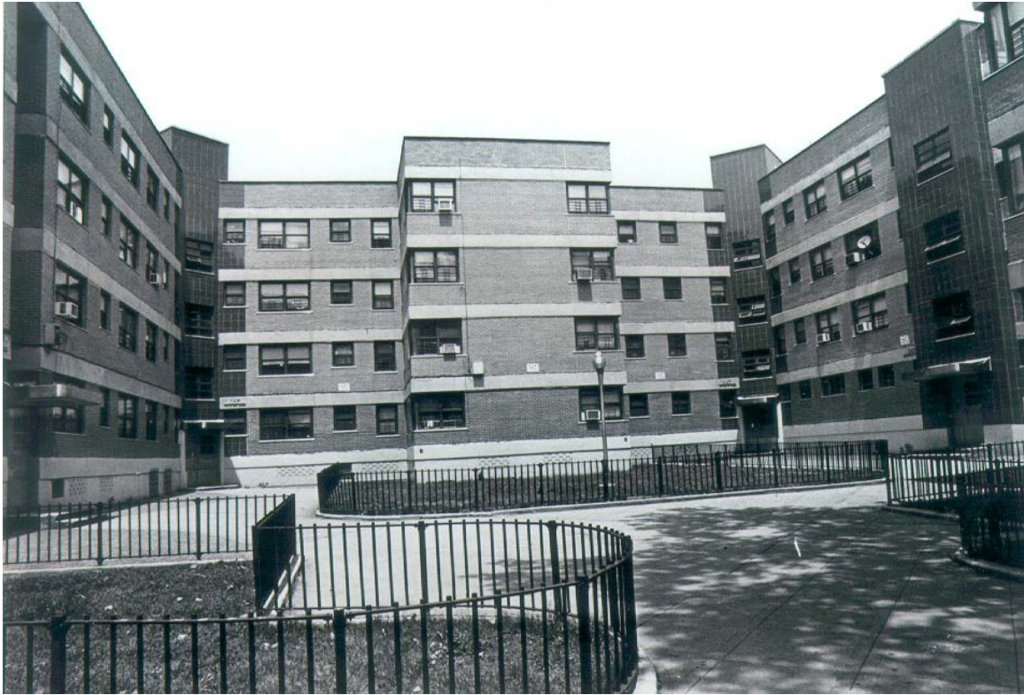
Williamsburg Houses Interior court: Ten Eyck Walk, near Graham Avenue (Building No. 8)