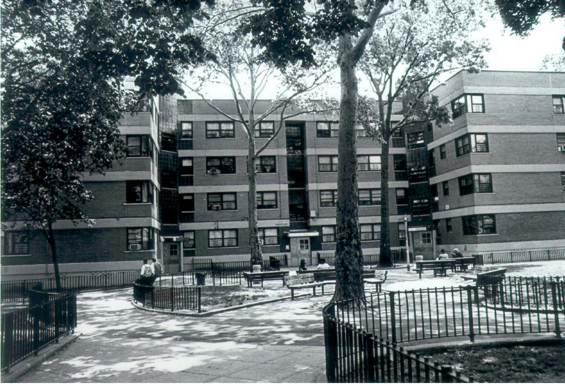
Willamsburg Houses Ten Eyck Walk, North facade of Building No. 4