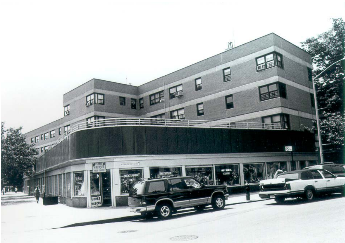
Williamsburg Houses Storefront at Maujer Street and Graham Avenue, part of Building No. 8