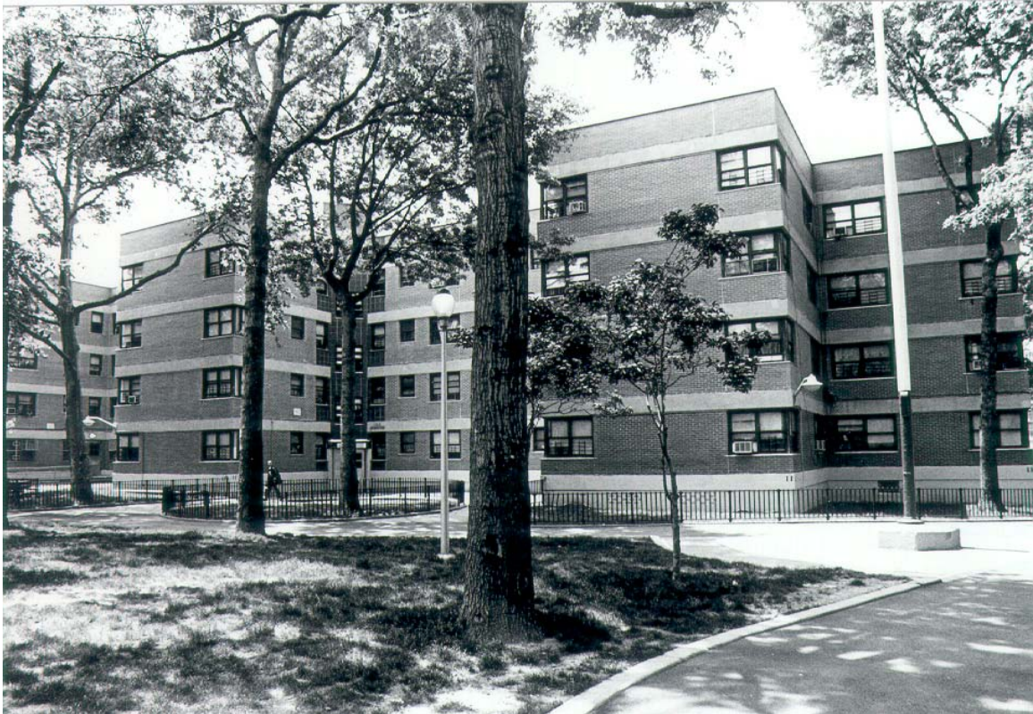
Williamsburg Houses East façade of Building No. 11