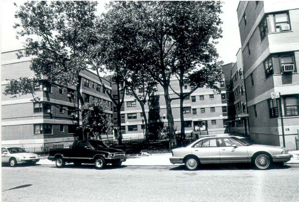
Williamsburg Houses Scholes Street, near Humbolt Street (Building No. 19)