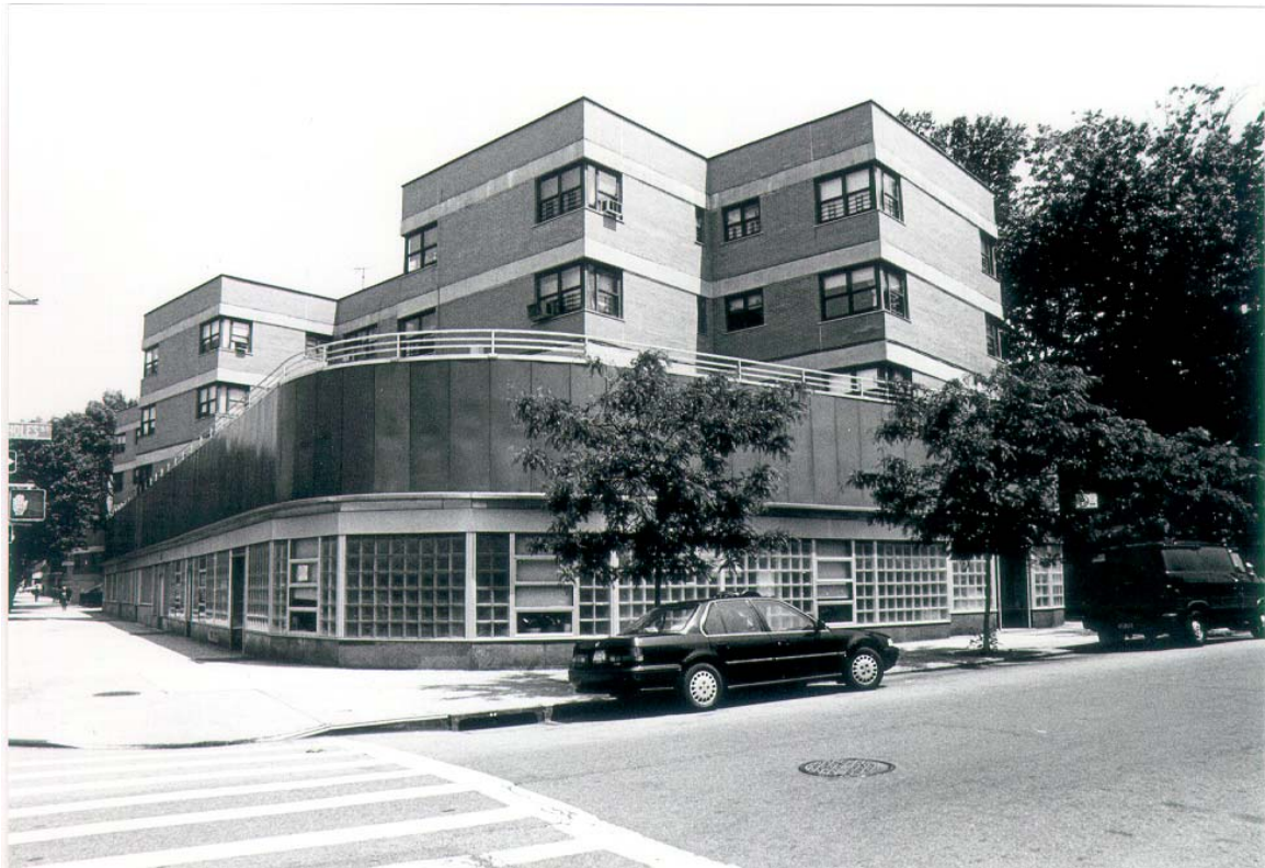
Williamsburg Houses Storefront at Scholes Street and Graham Avenue