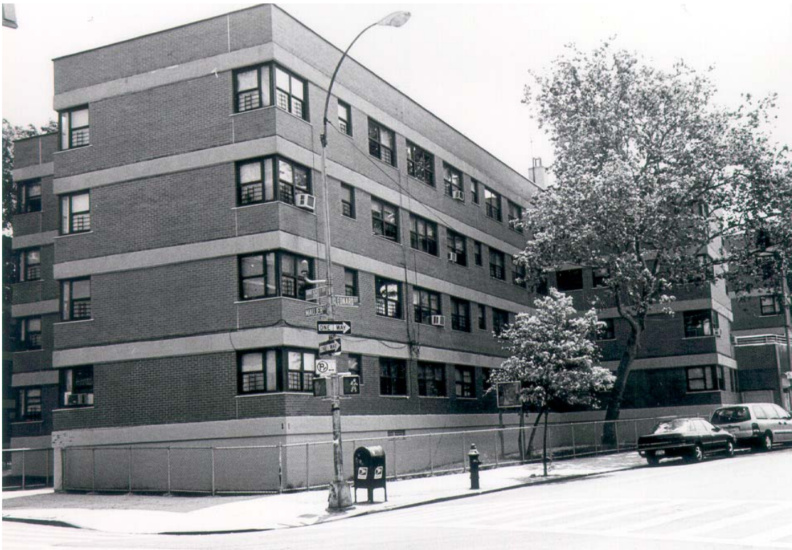
Williamsburg Houses Leonard Street, at Maujer Street (Building No. 1)