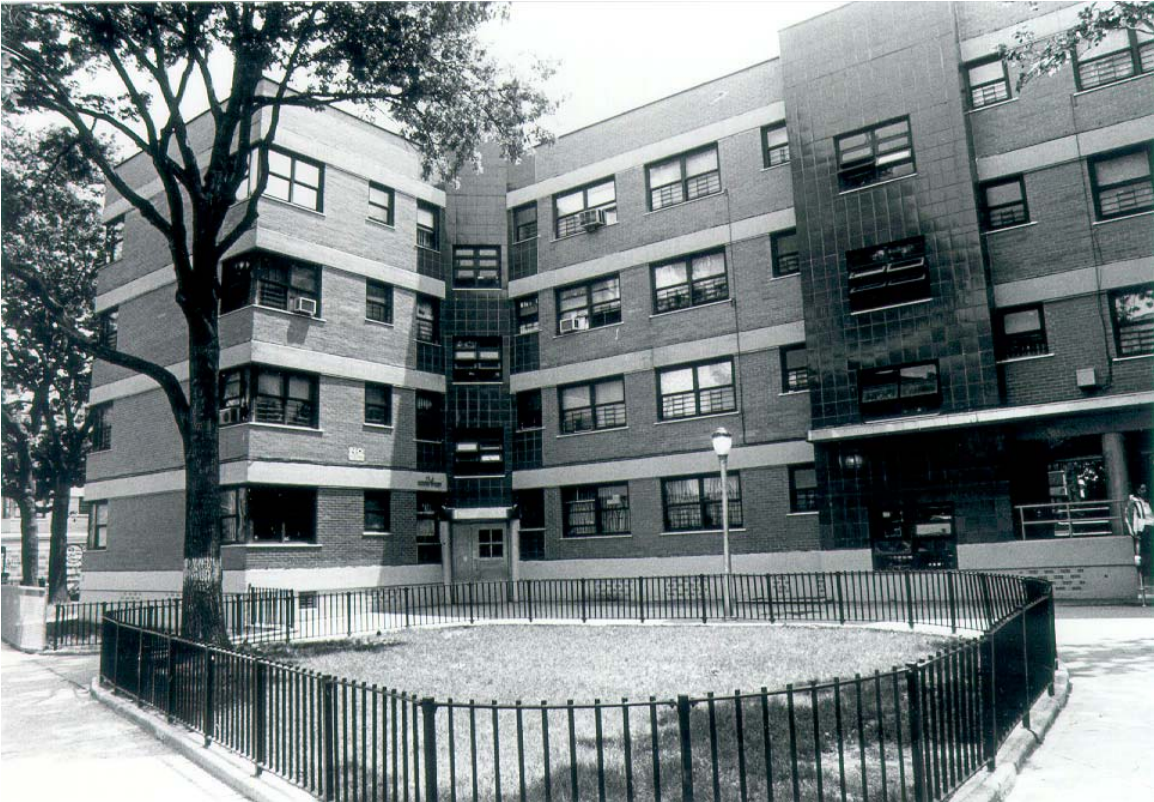
Willamsburg Houses Maujer Street, near Manhattan Avenue (Building No. 2)