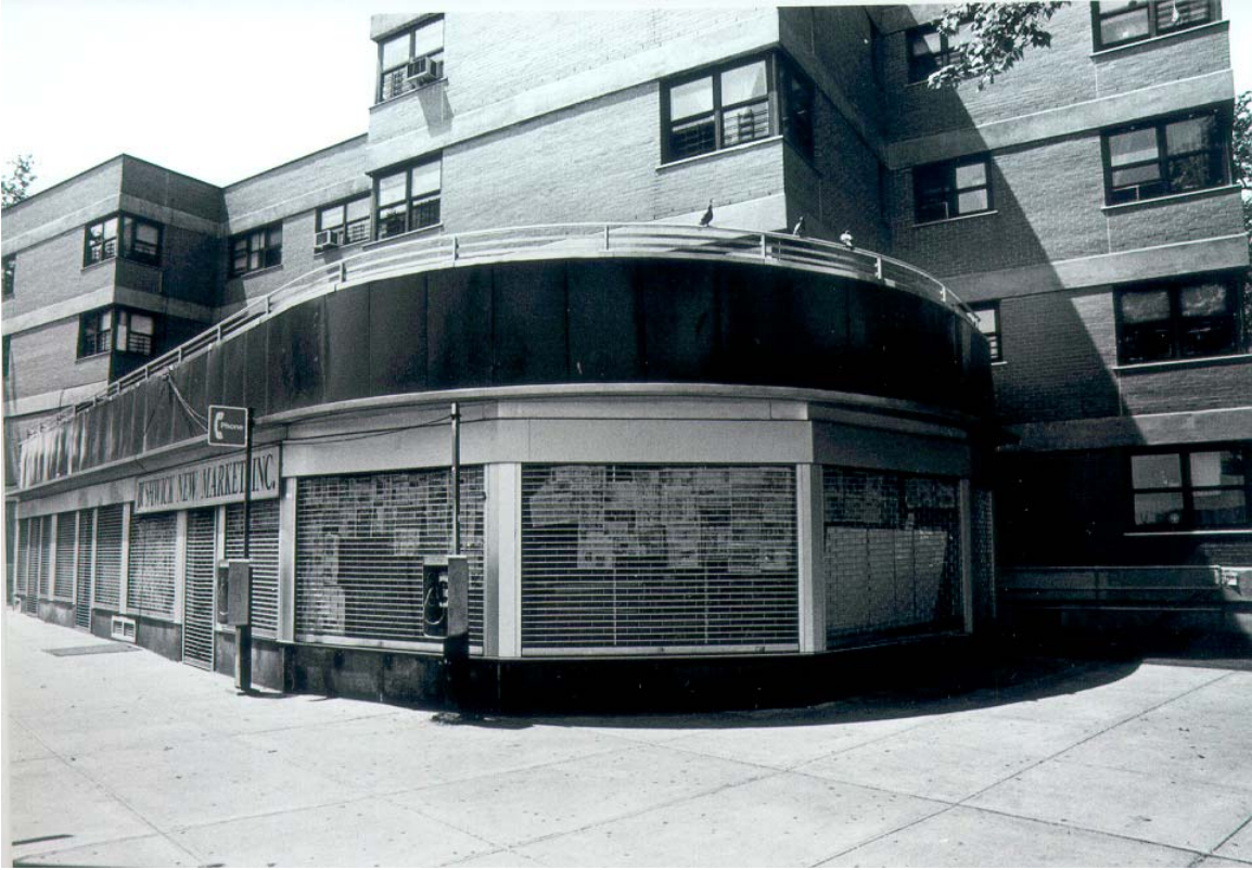
Williamsburg Houses Storefront at Bushwick Avenue and Stagg Walk