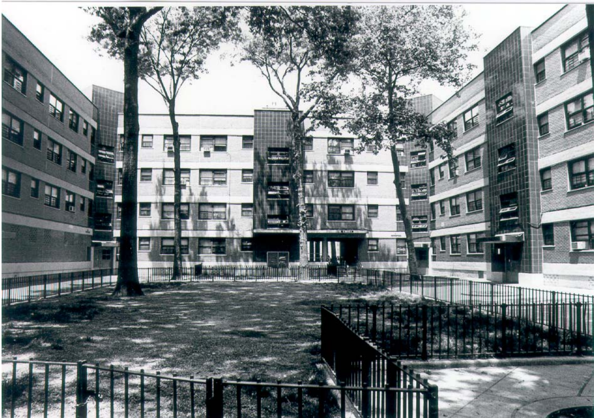
Williamsburg Houses Interior court: Ten Eyck Walk, near Leonard Street (Building No. 1)