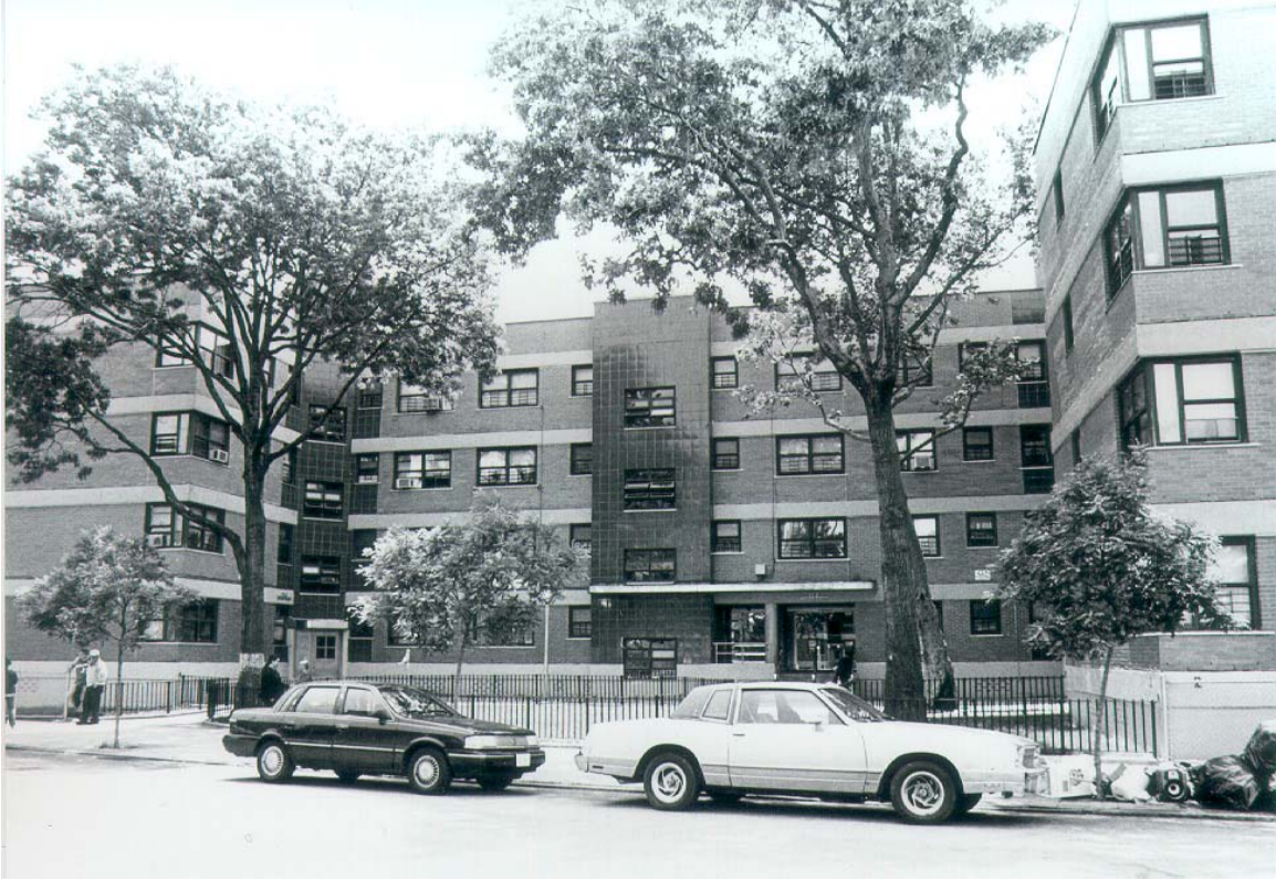
Williamsburg Houses Maujer Street, near Manhattan Avenue (Building No. 2)