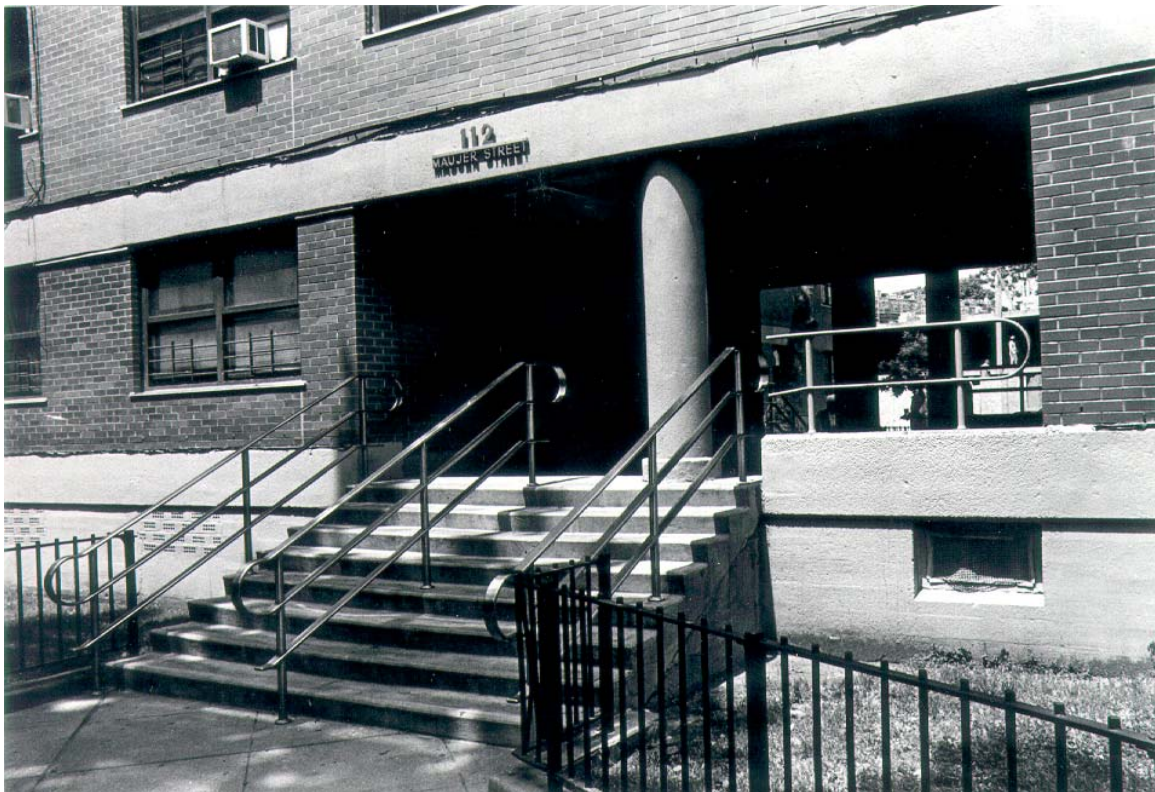
Williamsburg Houses Breezeway entrance at 112 Maujer Street, near Graham Avenue (Building No. 2)