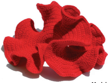
Model by Daina Taimina

Here we present a taxonomy of basic hyperbolic crochet models. To crochet a hyperbolic structure one simply increases stitches at a regular rate in every row. The more often you increase, the more quickly the model will ruffle up.