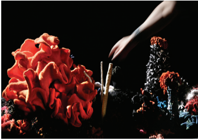
Ladies Silurian Atoll.

The Hyperbolic Crochet Coral Reef is a celebration of the intersection of geometry and handicraft and a testimony to the disappearing wonders of the marine world. Launched as a response to the devastation of living reefs from global warming and ocean acidification, the Crochet Reef resides equally in the realms of art, science, mathematics and environmentalism.