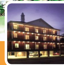
Bama Gameday Center