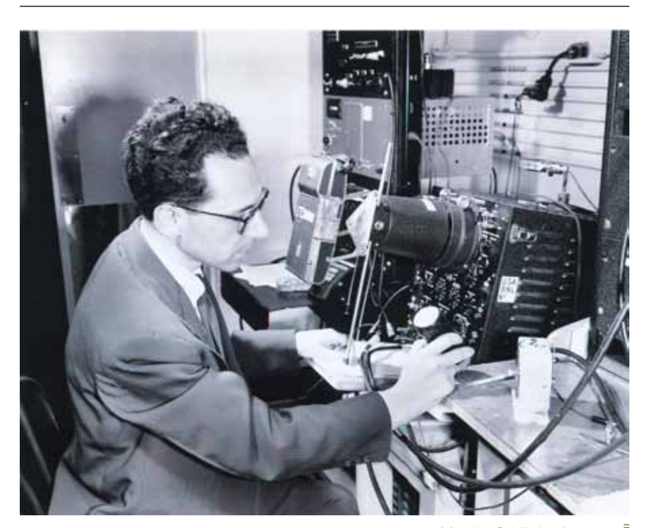
Maurice Goldhaber in 1951.

clusters of like disciplines, and the Goldhabers soon found themselves sharing research ideas with a group of physicists. A doctor in a nearby cluster, eavesdropping, took Maurice aside and asked, "Aren't