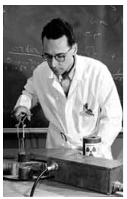
Goldhaber in 1959.

It was a remarkable feat of experimentation. Of the thousands of known nuclear transitions, the one involving <sup>152m</sup>Eu was, and still is, the only one known to work. Most physicists at the time did not realize that it was even possible