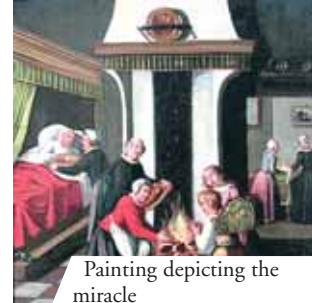
Painting depicting the miracle