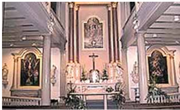
Chapel of the Blessed Sacrament