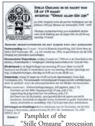
Pamphlet of the "Stille Omgang" procession