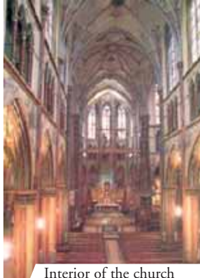
Interior of the church