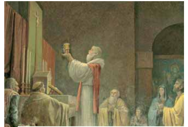
Picture that depicts the miracle present in the basilica