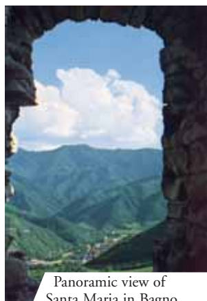
Panoramic view of Santa Maria in Bagno