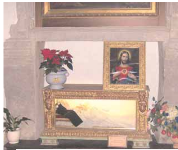
Chapel with the urn of Blessed Giovanna