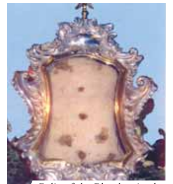
Relic of the Blood-stained corporal