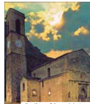
Basilica of Santa Maria di Bagno di Romagna