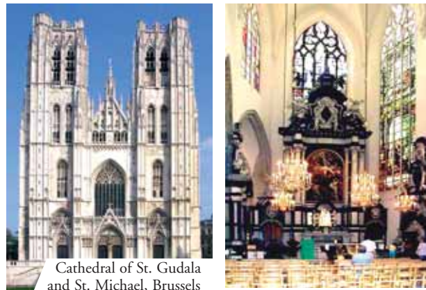
Cathedral of St. Gudala and St. Michael, Brussels