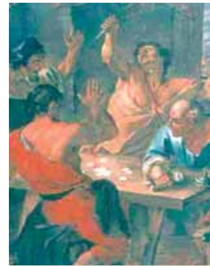
The Eucharistic Miracle at Brussels. Hérion Museum, Paray-le-Monial