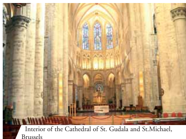
Interior of the Cathedral of St. Gudala and St. Michael, Brussels