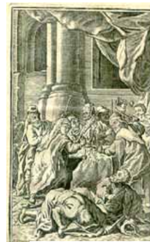
Old prints that portray the miracle