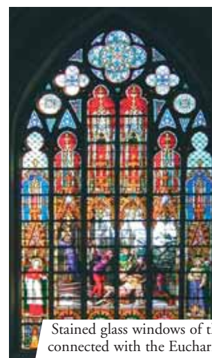
Stained glass windows of the cathedral depicting events connected with the Eucharistic miracle

The five stained glass windows that grace the side nave of the cathedral take us through stages of the Eucharistic miracle. They were installed at various times from 1436 to 1870. The Kings of Belgium, Leopold I and Leopold II, presented the first windows on the lower level. The others were gifts from various noble families of the country.