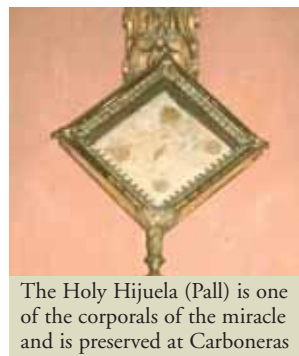
The Holy Hijuela (Pall) is one of the corporals of the miracle and is preserved at Carboneras