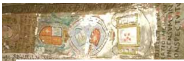
Frescos in the Chapel of Santa Hijuela, Carboneras