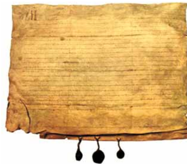
Carta de Chiva document describing the miracle, preserved at the collegiate church