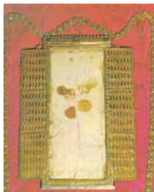
Relic of one of the two Blood-stained corporals preserved in the church of Daroca

The Eucharistic miracle of Daroca was verified shortly before one of the numerous battles sustained by the Spanish against the Moors. The Christian commanders asked the priest in the field to celebrate Mass, but a few minutes after the consecration, an improvised enemy attack obliged the priest to suspend the Mass and hide the consecrated Hosts amid the sacred linens of the celebration. The Spanish left the battle victorious and the commanders asked the priest to communicate the Hosts previously consecrated. However, they were found completely covered in Blood. Even today, it is possible to venerate the Blood-stained linens.