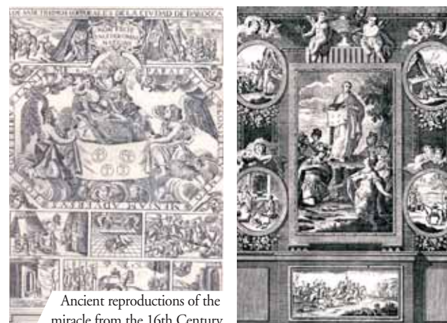
Ancient reproductions of the miracle from the 16th Century