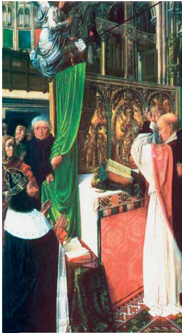
The Mass of St. Egidio in the presence of Charles Martel, National Gallery of London