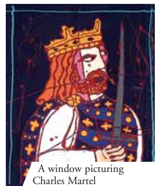
A window picturing Charles Martel