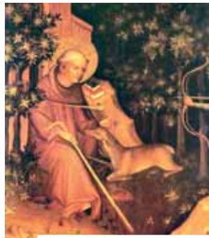
Saint Egidio and the Faun

Charles Martel had committed a grave sin, and stricken by remorse, decided to go to Provenza and present himself to a well-known abbot of the time named Egidio, in order to seek absolution for this sin, without actually confessing it and while keeping the crime committed a secret. Saint Egidio was officiating at a Mass when an angel appeared and placed himself near the altar, carrying in his hand a book in which was written the unconfessed fault. As the celebration continued, the writing in the book faded little by little until it completely disappeared, and Charles Martel felt himself absolved.