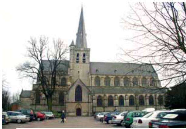
Church of San-Waldevtrudis, Herentals

In the Eucharistic miracle of Herentals, some Hosts that had been previously stolen were found after eight days, and perfectly intact, in spite of the rain. The Hosts were found in a field near a rabbit burrow, surrounded by a bright light and arranged in the form of a cross. Every year, two paintings of Antoon van Ysendyck, depicting the miracle, are taken in procession to the field where a small shrine, De Hegge , was built. Here a commemorative Mass is celebrated before numerous people. The two paintings are presently kept in the Cathedral of Sint-Waldevtrudiskerk, Herentals.