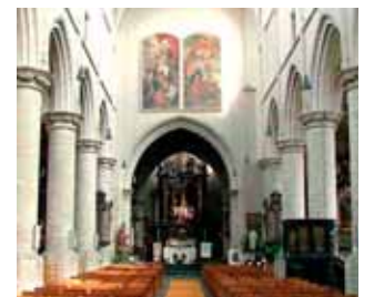
Interior of the Church of San-Waldevtrudis