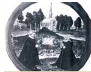
Painting of Van Ysendyck depicting the miracle