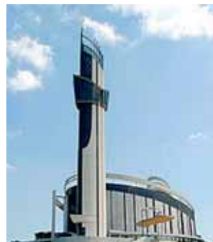
Shrine of the Divine Mercy, Cracow