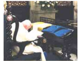
In the year 2000, Pope John Paul II decreed that on the first Sunday after Easter, the Liturgical Feast of Divine Mercy is to be celebrated

Jesus to St. Faustina: "My daughter, help me to save a sinner in agony; recite the Rosary that I taught you for sinners". Sr. Faustina: "When I started to recite the Rosary, I saw a soul on his death bed suffering terrible torture and pain in fighting the last battle of life. The soul was being defended by his guardian angel, who was, however, helpless... A great multitude of demons were waiting for the soul, but while I was reciting the Rosary chaplet, I saw Jesus in the same aspect as depicted in the painting. The bright rays coming out of the Heart of Jesus surrounded the sick soul and the forces of evil ran away... The sick person died serenely. When I regained my consciousness, I realized that the divine chaplet Rosary was an important prayer to be recited around the dying. This placates God's wrath." (St. Faustina Kowalska, Diary , Vatican Library Edition, p. 515)