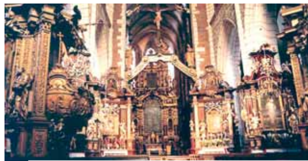
Inside of the Corpus Christi Church, Krakow