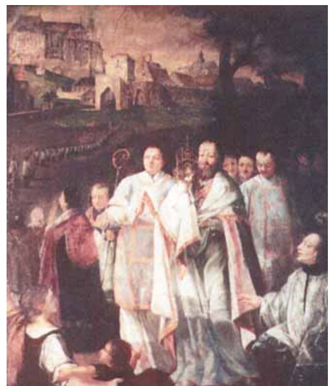
A representation of the procession of the bishop back into the city after finding the Hosts of the miracle in the marsh

spot where the treasure had been abandoned. Bright flashes of light were visible for several kilometers. Frightened villagers approached the area and reported back to the Bishop of Krakow. The bishop called for three days of fasting and prayer. On the third day, he led a procession out to the marsh. There, they found the monstrance, and within it they found the Hosts, which were unbroken and were the source of the unusual lights. The people began to pray and to celebrate the miracle. Annually on the occasion of the feast of Corpus Christi, the miracle is celebrated in the church of Corpus Christi in Krakow.