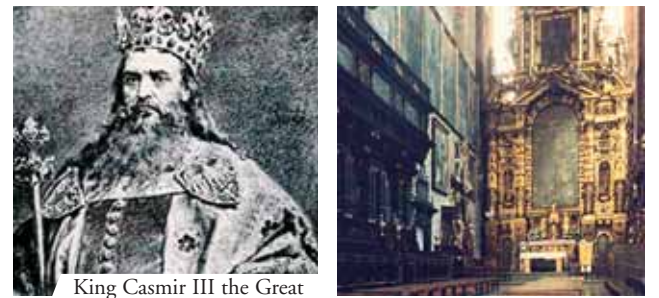
King Casimir III the Great