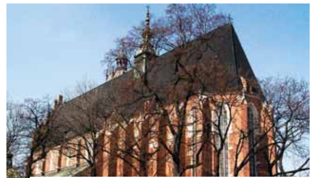
The Corpus Christi Church, Krakow

In the year 1345, King Casimir III the Great of Poland gave orders to build a church named Corpus Christi in honor of the Eucharistic miracle that was verified that same year. It had taken place in the village of Wawel, near Krakow. Some thieves broke into a little church (The Collegiate Church of All Saints), which was a short distance from Krakow. They forced their way into the tabernacle and stole the monstrance, which contained consecrated Hosts.