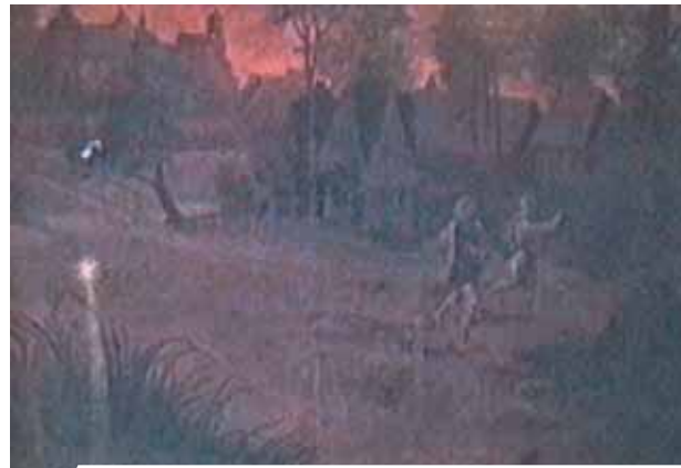
Painting in the Corpus Christi Church depicting the phenomenon of bright flashes coming from the marsh

The Eucharistic miracle of Krakow relates to consecrated Hosts that emitted an unusual bright light when they were hidden by thieves in a muddy marsh. The thieves had stolen a monstrance containing consecrated Hosts from a church in the village of Wawel (outside of modern-day Krakow). They ultimately abandoned the monstrance and Hosts in a marsh outside of the village, where the miracle took place. The Church of Corpus Christi in Krakow, Poland contains paintings depicting the miracle as well as documents and depositions relating to the matter.