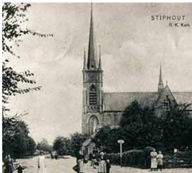
Saint Trudo's Church, Stiphout