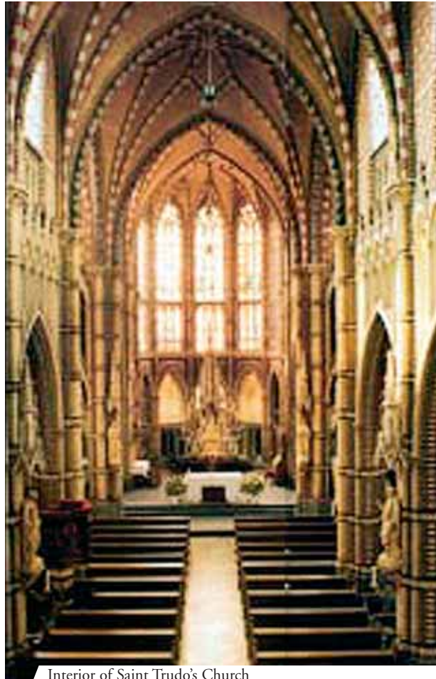
Interior of Saint Trudo's Church

This event is celebrated each year by the residents of Stiphout especially on the feast of Corpus Christi.