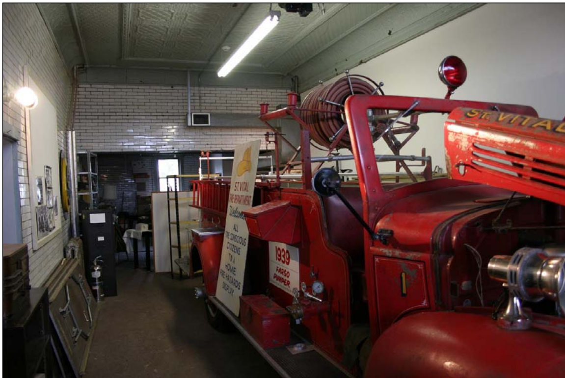
Plate 15 – Former St. Vital Fire Hall and Police Station, 596 St. Mary's Road, south bay with its original tin ceiling and tiled walls, 2009.