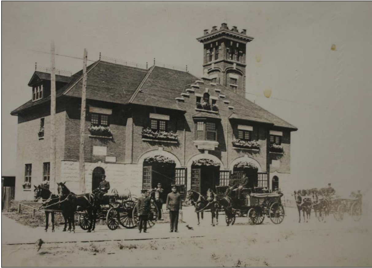
Plate 2 – The St. Vital Fire Hall and Police Station, ca.1914.