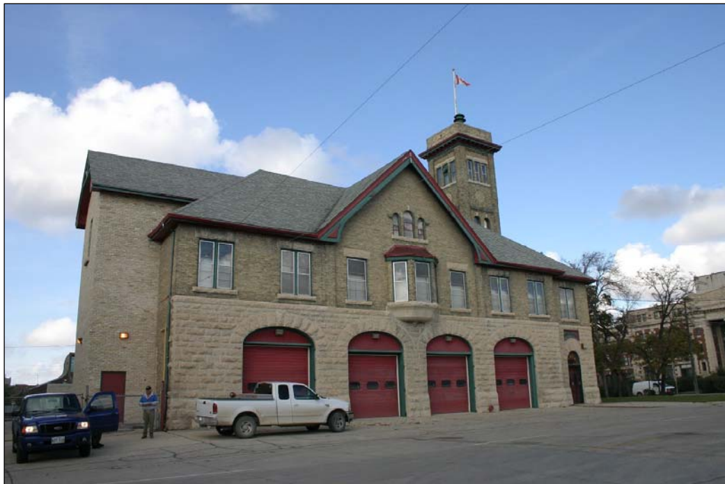
Plate 7 – Former Winnipeg Fire Hall No. 3, 56 Maple Street, Grade II, now Winnipeg Fire Fighters Museum. Exterior alterations include replacement of windows and overhead doors.