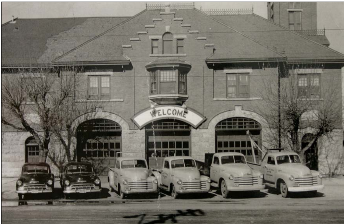
Plate 21 – St. Vital Fire Hall and Police Station, with “R.M. of St. Vital” trucks parked in front, ca.1950. Note the metal cresting is still intact on the roof and the south addition has been completed.