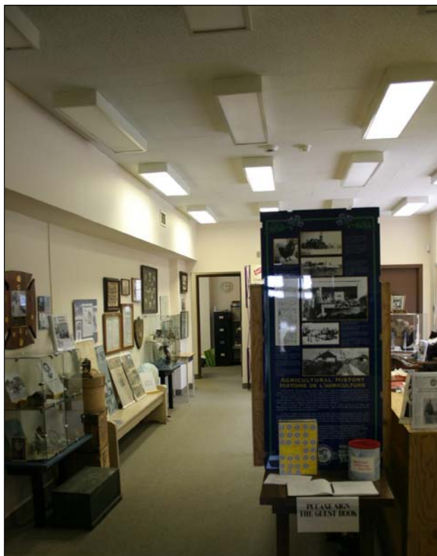
Plate 13 – Former St. Vital Fire Hall and Police Station, 596 St. Mary's Road, former police area (south end), now museum space, 2009. (M. Peterson, 2009.)