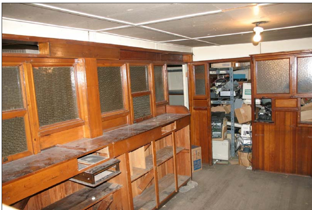
Plate 17 – Former St. Vital Fire Hall and Police Station, 596 St. Mary's Road, second floor counters, 2009.