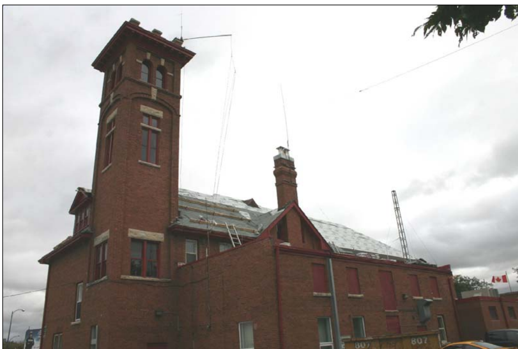
Plate 12 – Former St. Vital Fire Hall and Police Station, 596 St. Mary's Road, rear (west) façade, 2009.