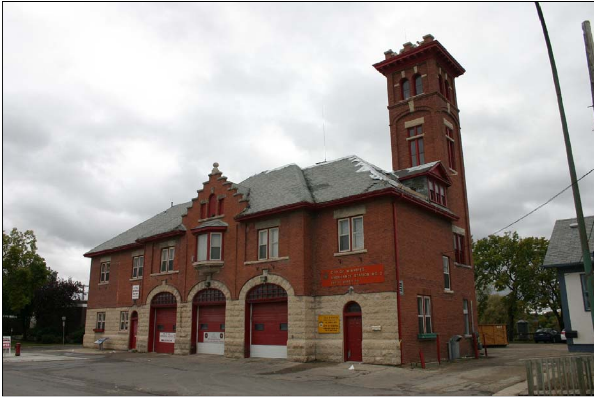
Plate 8 – Former St. Vital Fire Hall and Police Station, 596 St. Mary's Road, front (east) and north façades, 2009.