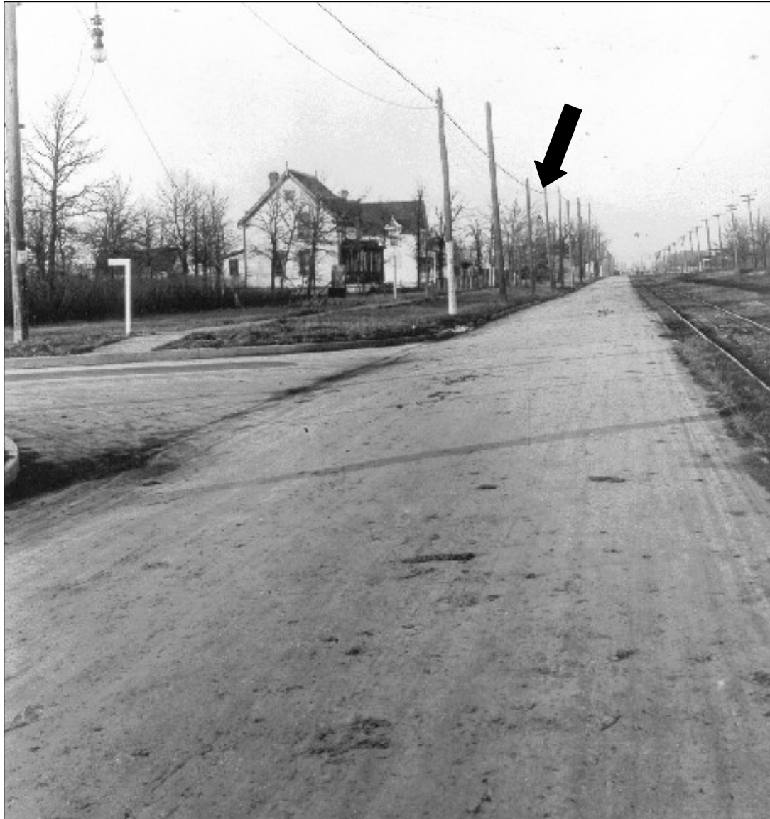
Plate 3 – St. Mary's Road immediately south of the fire hall, ca.1920. The tower of the fire hall is barely visible through the trees (arrow).