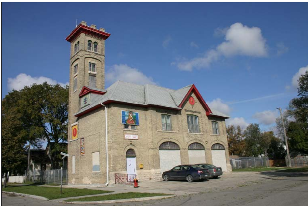
Plate 5 – Former Winnipeg Fire Hall No. 11, 180 Sinclair Avenue, Grade III, now the Wat Lao Zayaram of Manitoba Inc. Buddhist Temple Community Centre. Exterior alterations include the boarding up of several windows and the overhead doors.