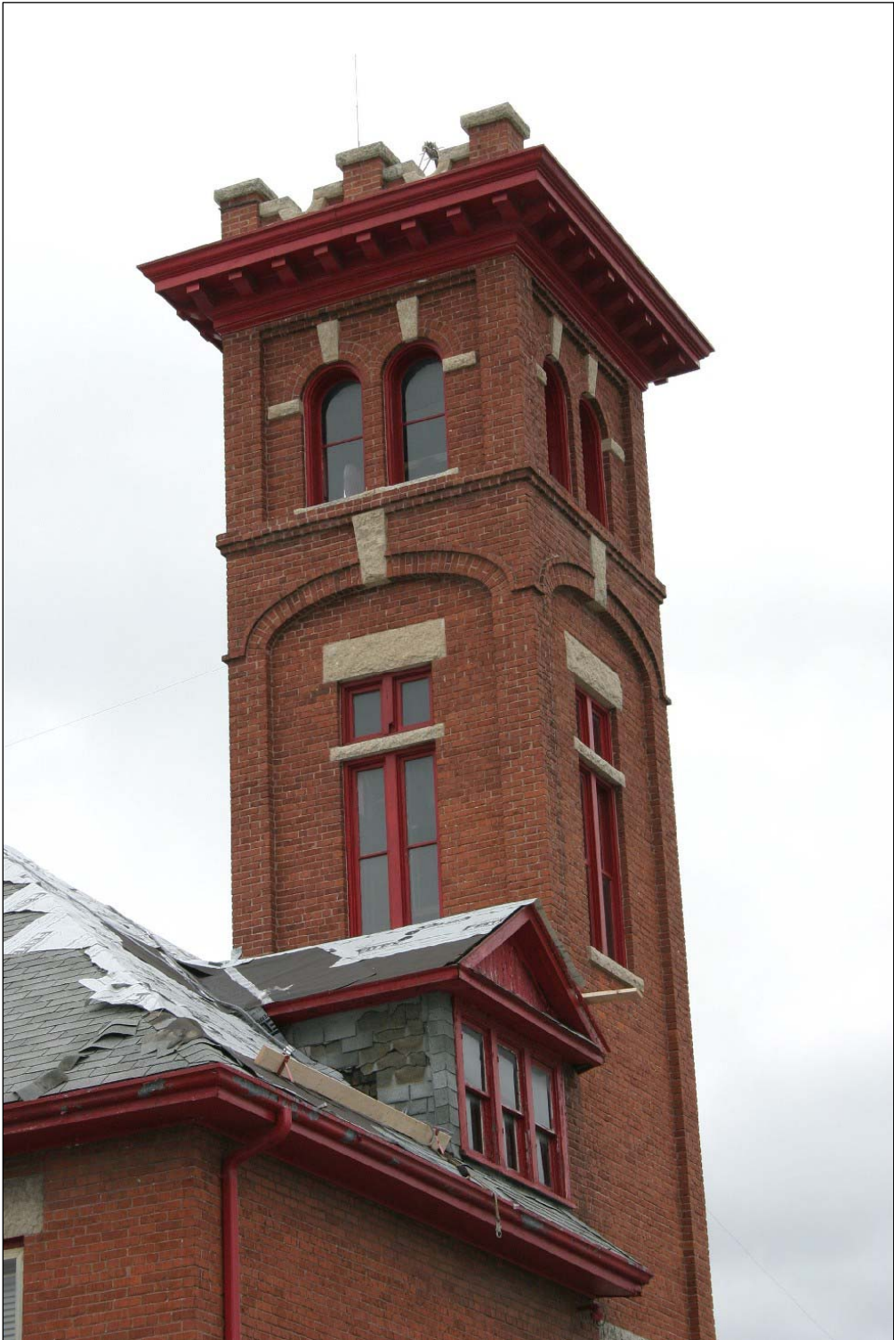
Plate 11 – Former St. Vital Fire Hall and Police Station, 596 St. Mary's Road, tower detail, 2009.