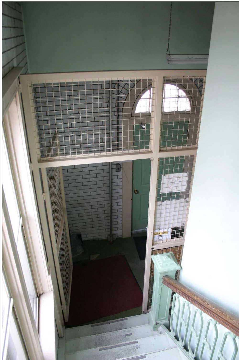
Plate 16 – Former St. Vital Fire Hall and Police Station, 596 St. Mary's Road, northeast entrance foyer, 2009. ( M. Peterson, 2009. )