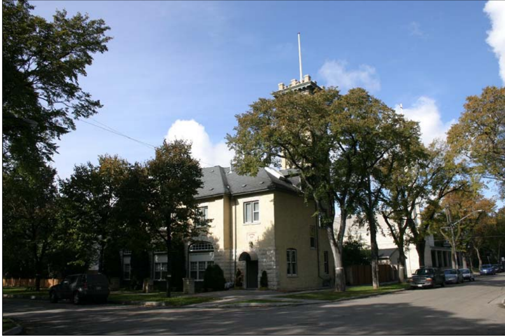
Plate 4 – Former Winnipeg Fire Hall No. 12, 1055 Dorchester Street, Grade III, now multi-tenant residence. Exterior alterations include the replacement of all windows and the replacement of the overhead doors.