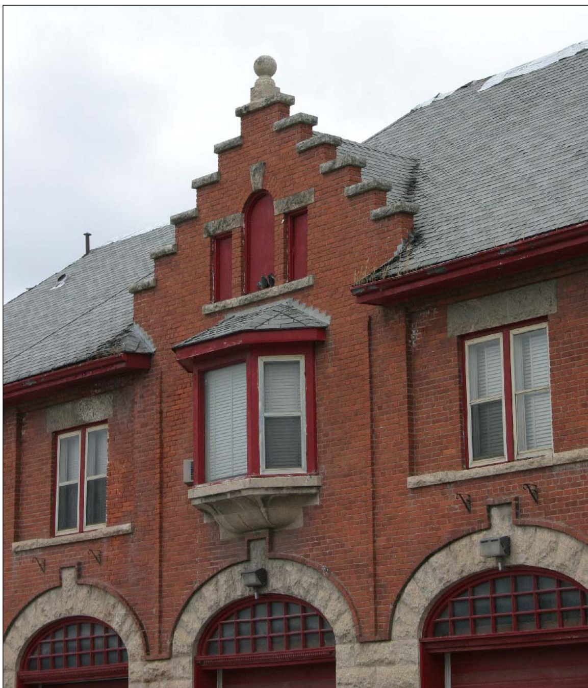
Plate 9 – Former St. Vital Fire Hall and Police Station, 596 St. Mary's Road, front (east) façade detail, 2009.