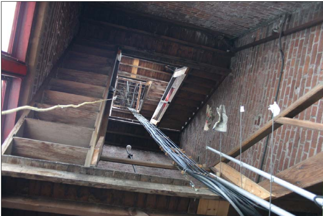
Plate 19 – Former St. Vital Fire Hall and Police Station, 596 St. Mary's Road, interior of tower, 2009.