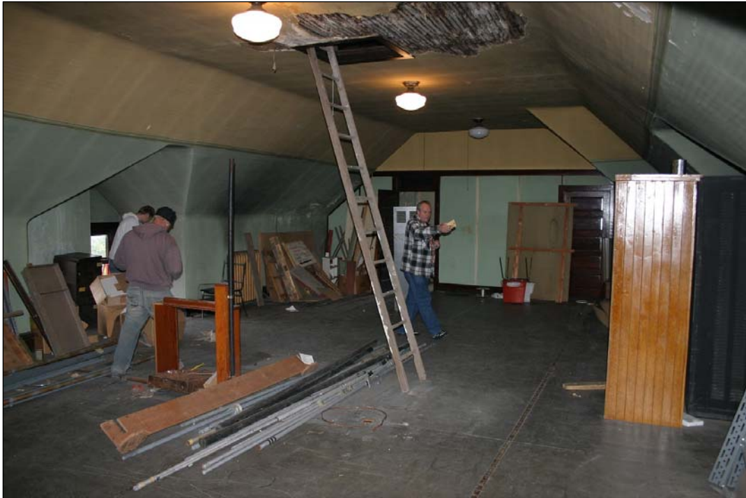
Plate 18 – Former St. Vital Fire Hall and Police Station, 596 St. Mary's Road, third floor, 2009.