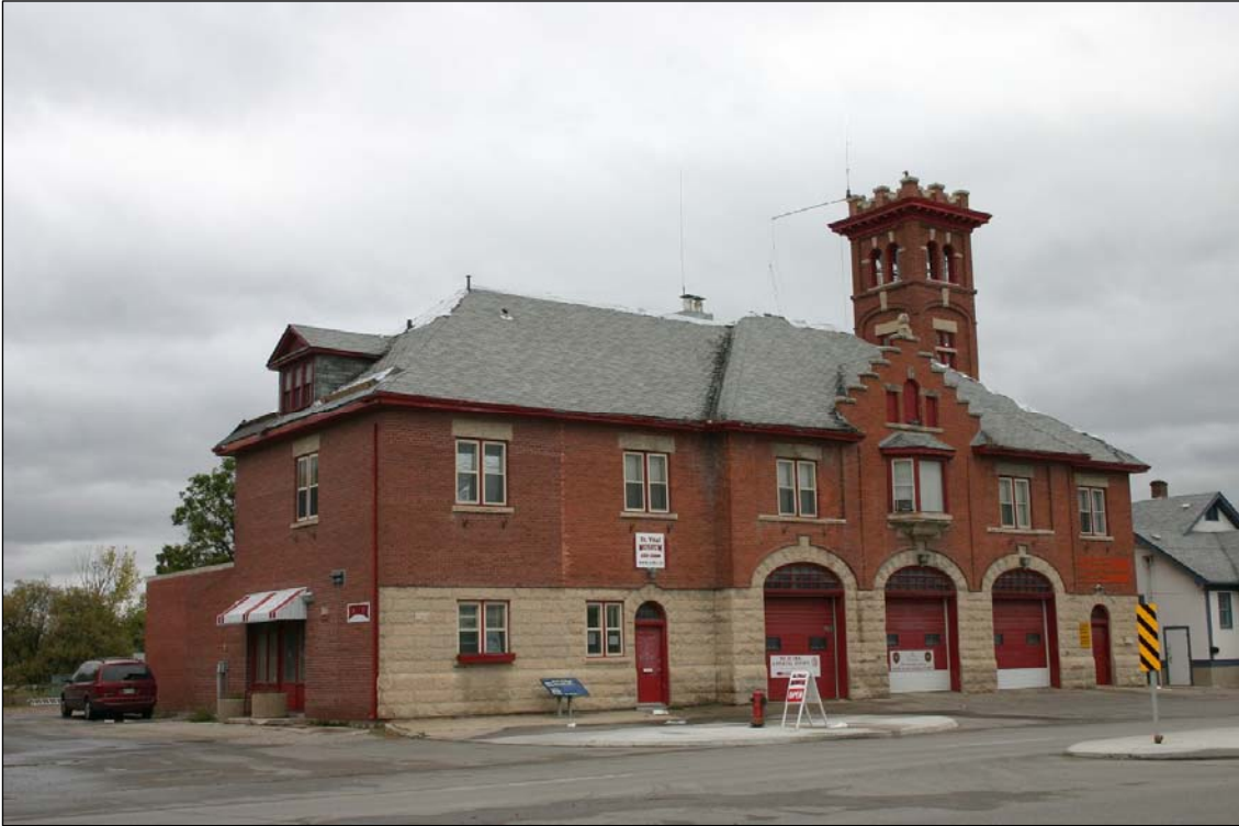
Plate 10 – Former St. Vital Fire Hall and Police Station, 596 St. Mary's Road, front (east) and south façades, 2009. ( M. Peterson, 2009. )