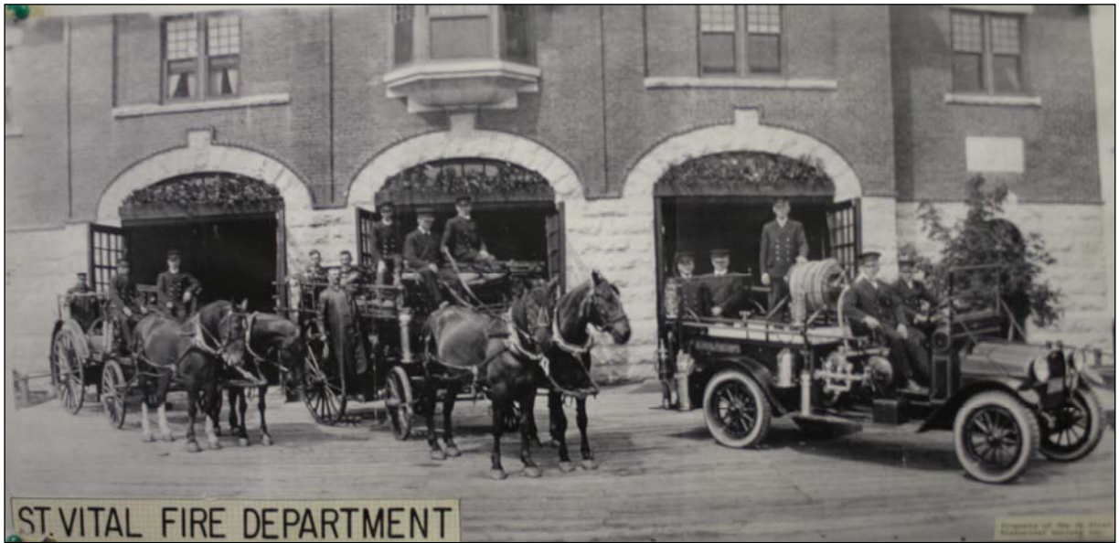
Plate 20 – St. Vital Fire Hall and Police Station, no date. Note the equipment includes both horse-drawn and gasoline-driven machinery.