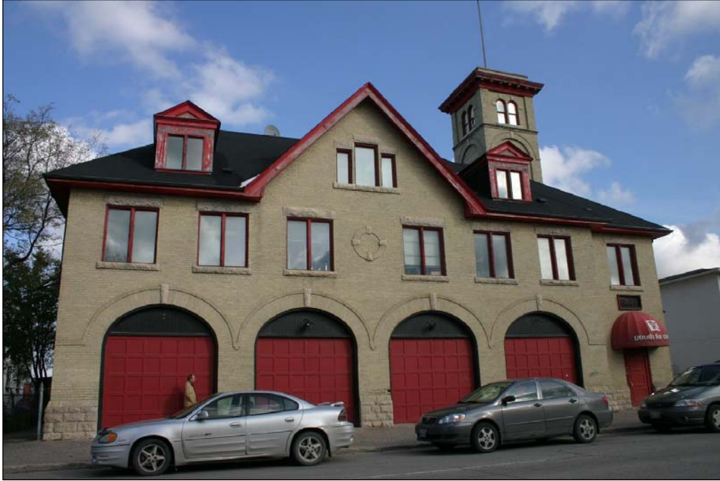
Plate 6 – Former Winnipeg Fire Hall No. 8, 325 Talbot Avenue, Grade III, now offices. Exterior alterations include replacement of second storey windows. ( M. Peterson, 2009. )