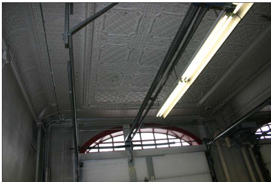
Plate 14 – Former St. Vital Fire Hall and Police Station, 596 St. Mary's Road, original tin ceiling in the ambulance bay, 2009.