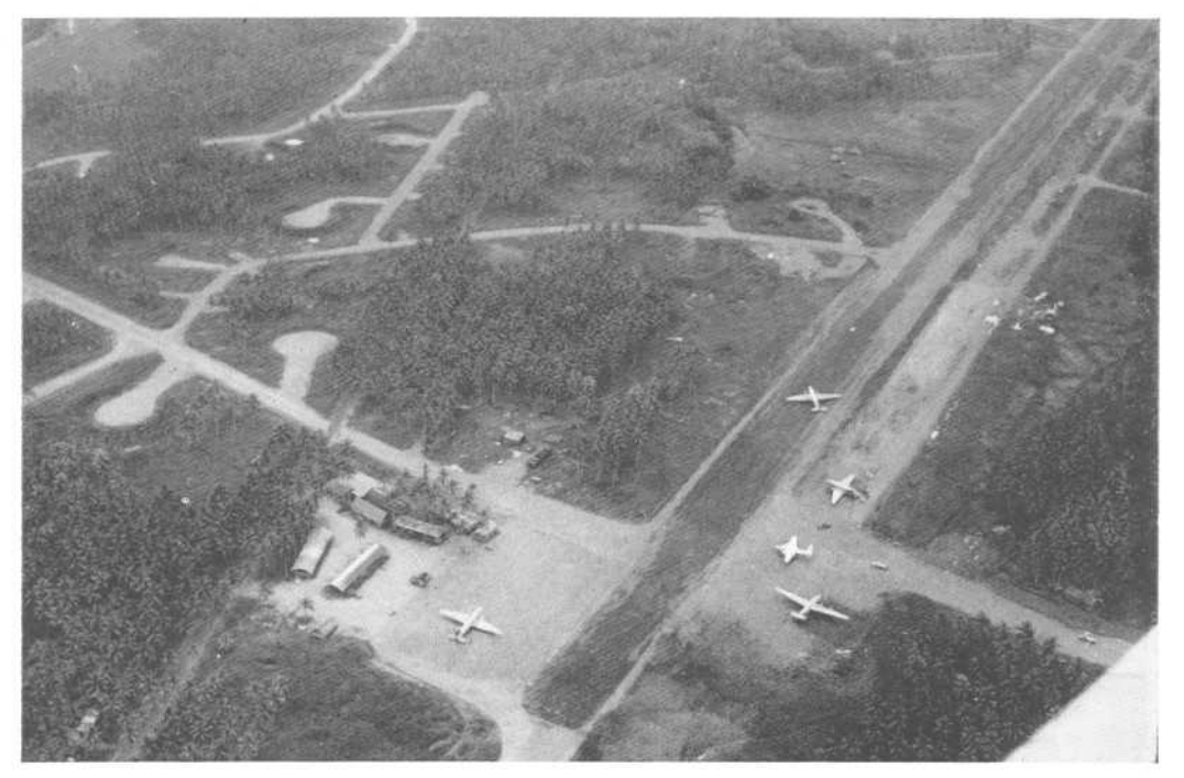
Gurney Airfield at Milne Bay.