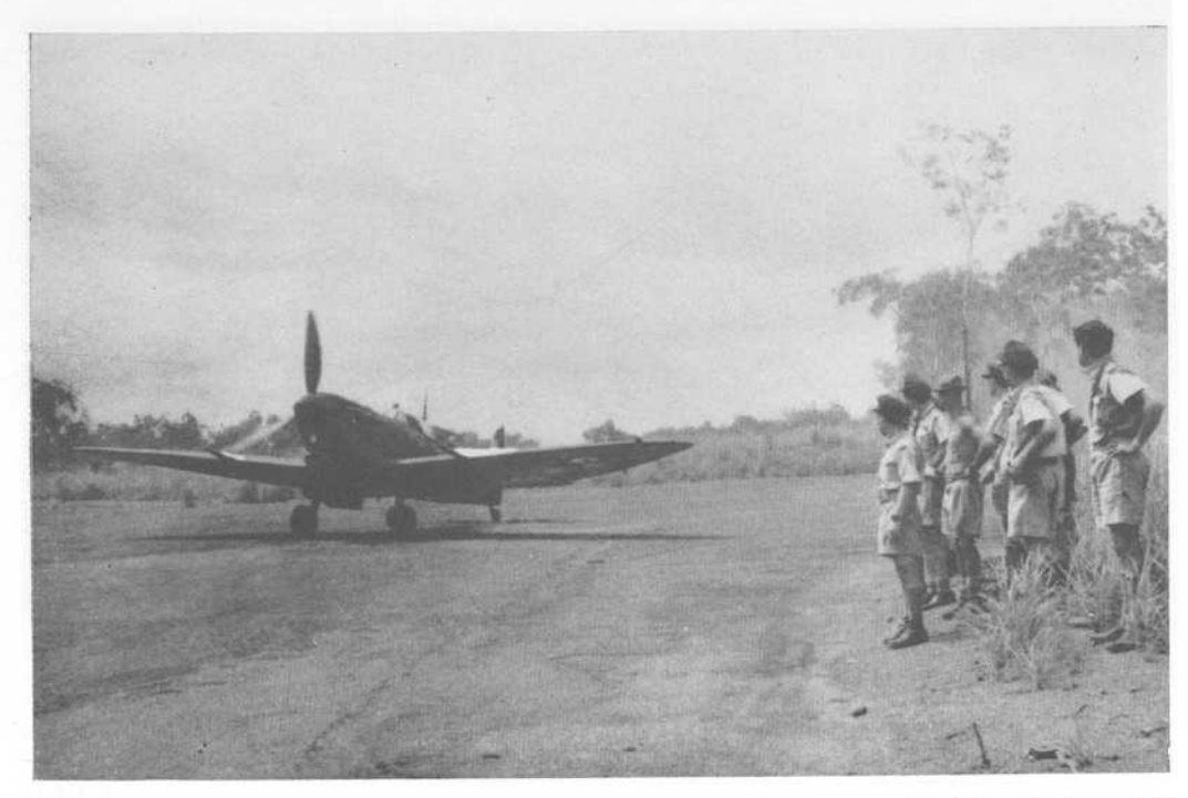
A Spitfire taking off from a Darwin airfield.