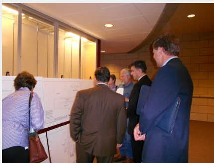
Public hearing for the EA/EIE in North Haven on June 14th.