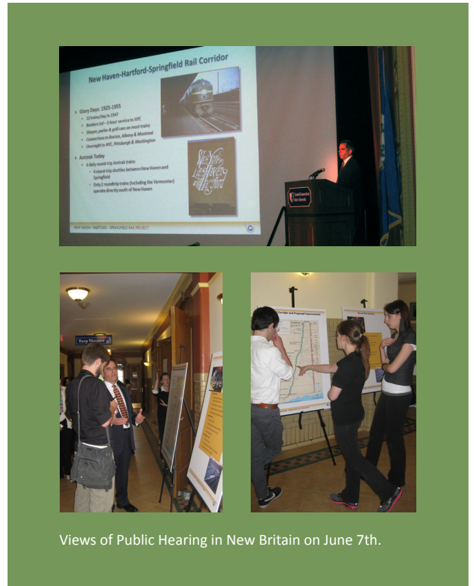
Views of Public Hearing in New Britain on June 7th.