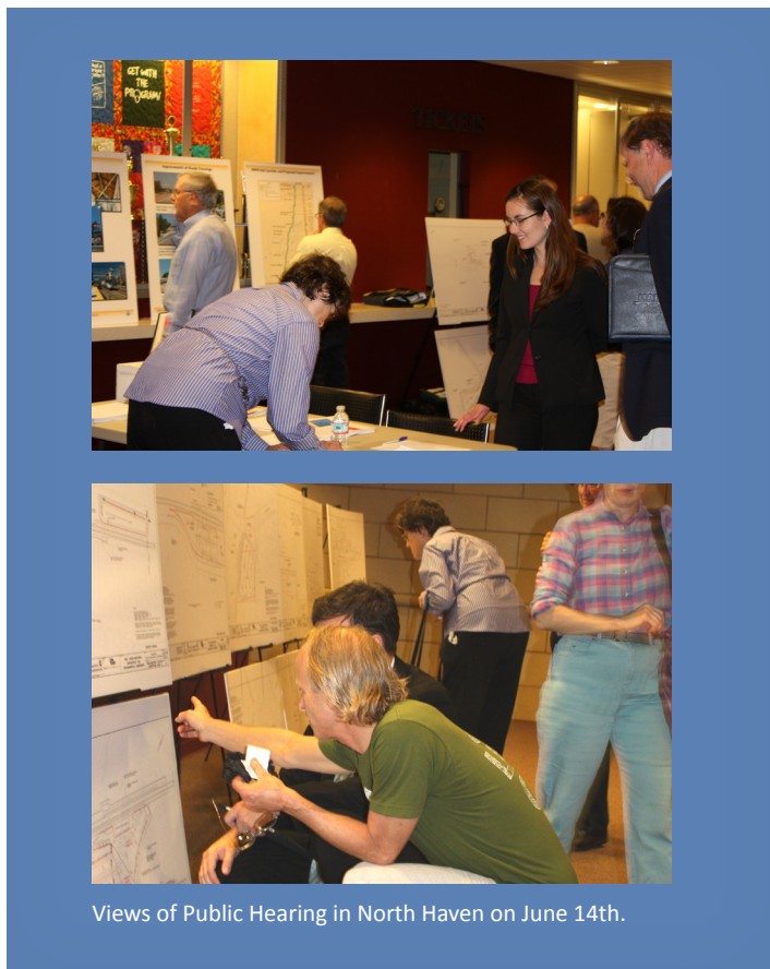
Views of Public Hearing in North Haven on June 14th.