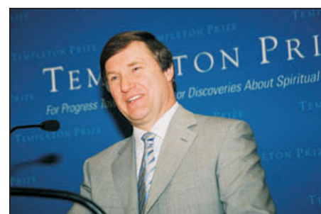
John D. Barrow

The hallmark of his work is a deep engagement with those aspects of the structure of the universe and its