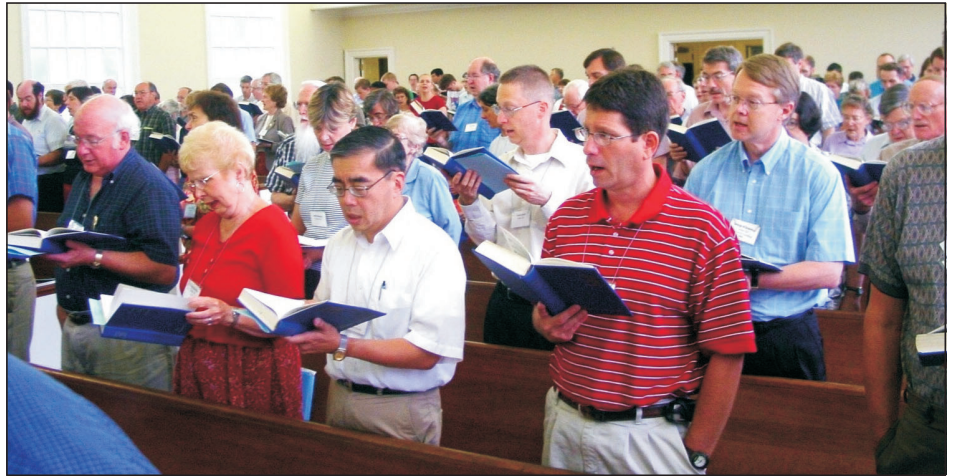
ASA 2005 annual meeting attendees worshipping together.