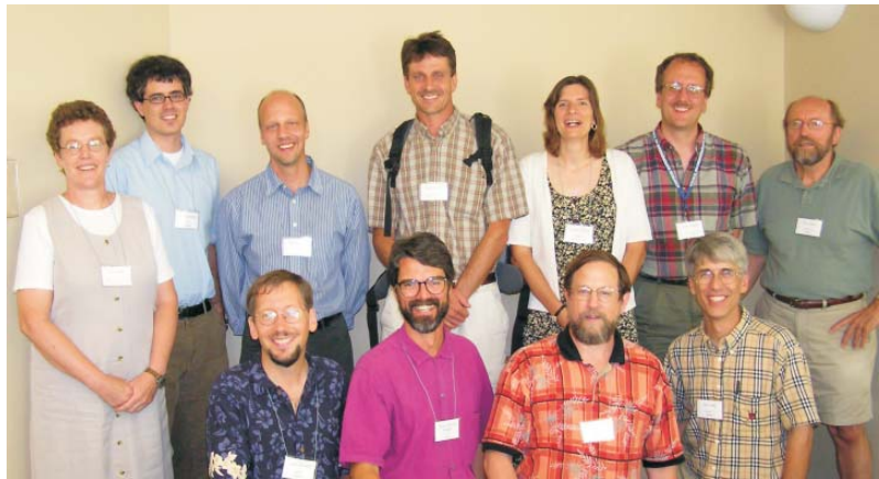
Presenters at the TWU Environmental Symposium