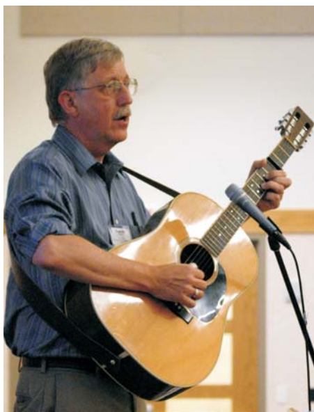
After his plenary lecture, Francis Collins brought out his guitar and accompanied the audience singing this hymn.