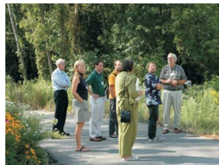
Tour of grounds around Helen Bunker Interpretive Center