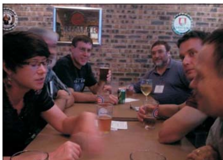
Socializing in Naperville

The 2011 ASA Annual Meeting took place on the campus of North Central College in Naperville, IL, from July 29 to August 1. Listen to MP3 audio from over 50 lectures, discussions, and symposia from the Annual Meeting at www.asa3.org/ASAradio/ASA2011_index.html or purchase them on DVD or CD at http://www.florianaudiovisual.com/ashop/asa.php?cat=124 .