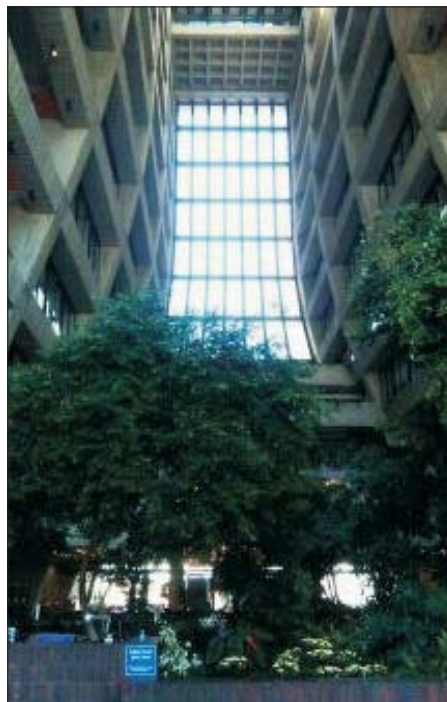
Field Trip to Fermilab