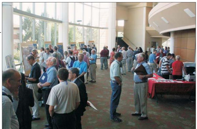
Mingling at the Poster Session

Remember that Coming Events are now listed on our website, www.asa3.org