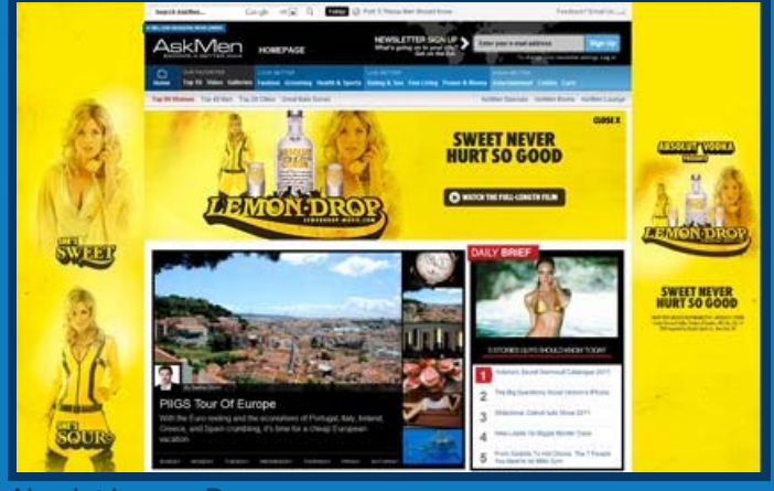
Absolut Lemon Drop