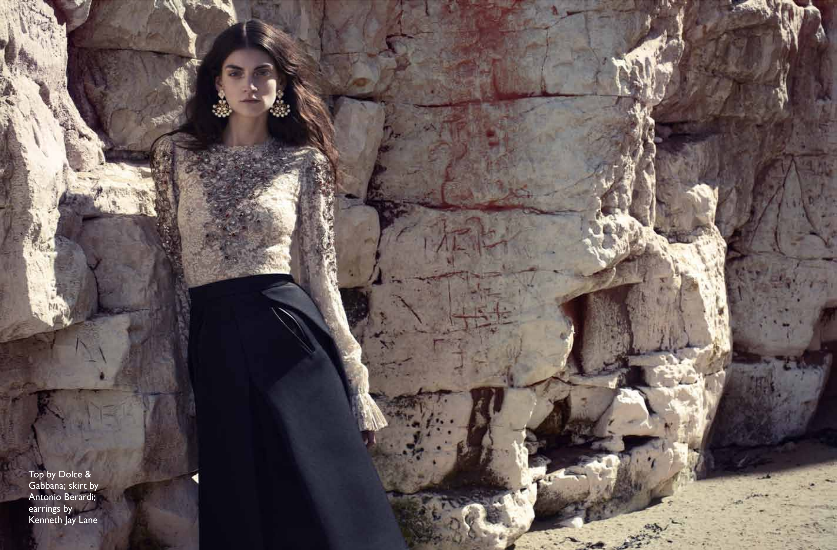
Top by Dolce & Gabbana; skirt by Antonio Berardi; earrings by Kenneth Jay Lane