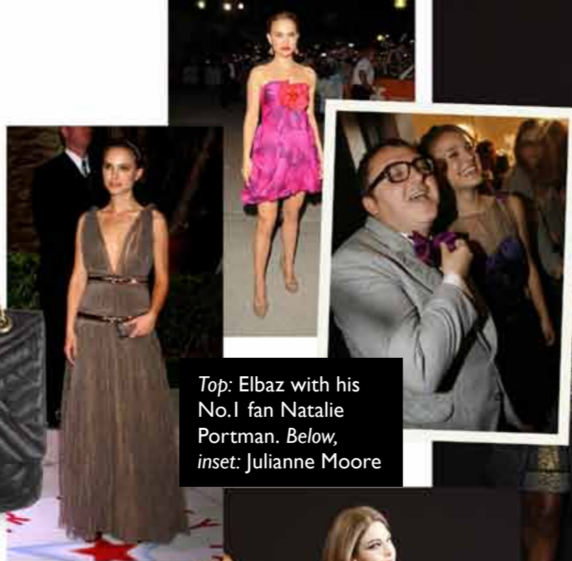
Top: Elbaz with his No.1 fan Natalie Portman. Below, inset: Julianne Moore

No wonder, then, that his legion of fans includes some of the most photographed and stylish women in the world: from Charlize Theron, Chloë Sevigny and Natalie Portman to Carey Mulligan, Sofia Coppola and Julianne Moore... the list goes on. And so to this fall – he's in a party mood and has loaded the new collection with the most extravagant, jewel-toned cocktail dresses: heavy on embellishment and seriously high on glamour. For extra fun, the lineup includes embroidered Happy Birthday bags, padded diamanté sneakers, wear-with-anything sandals and exquisite Deco-feel necklaces. Bon anniversaire, Alber!