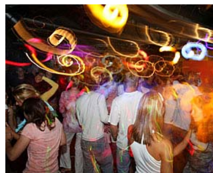
The players hit the dance floor and let their hair down during the Sony Ericsson WTA Tour Player Party on Wednesday evening in Bad Gastein.