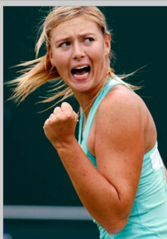
Sharapova eyes defense as Tour heads to San Diego, Stockholm (See Page 9)