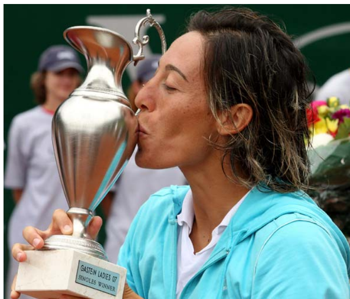
In six of her first eight finals, Schiavone fell in straight sets. She pushed eventual champions to three at 2000 Tashkent (Tulyaganova) and 2006 Sydney (Henin).

"She was playing very tough and had a wonderful week, but I