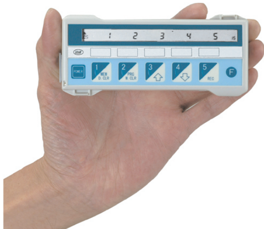
Very lightweight & compact

* 1: Only 4 digits of the counter can be viewed on the display of the unit. To view the 5 digits internal counter value, please use the communication feature of the unit to recall the data.