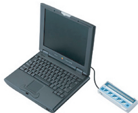
Easy connecting to PC