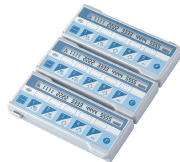
Easy to line up some Pocket counters