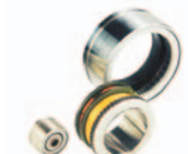
HAROWE™ brand Ultra-Performance Resolvers