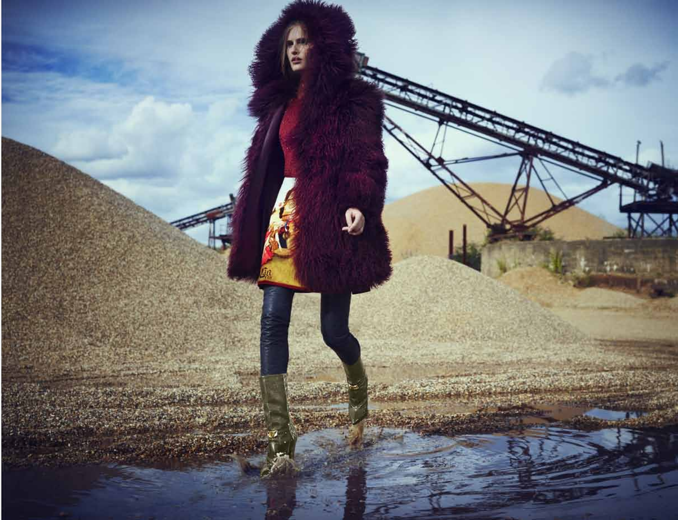
Coat by Versus; dress by Kaufmanfranco; shirt and skirt by Carven; pants by Preen Line; boots by Missoni