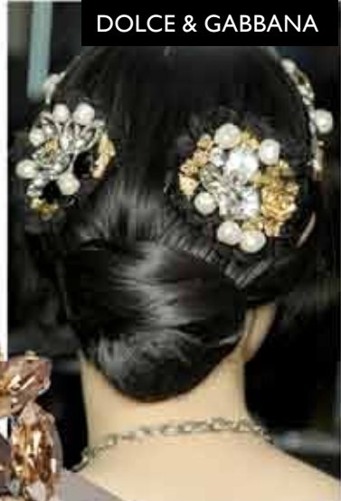
DOLCE & GABBANA