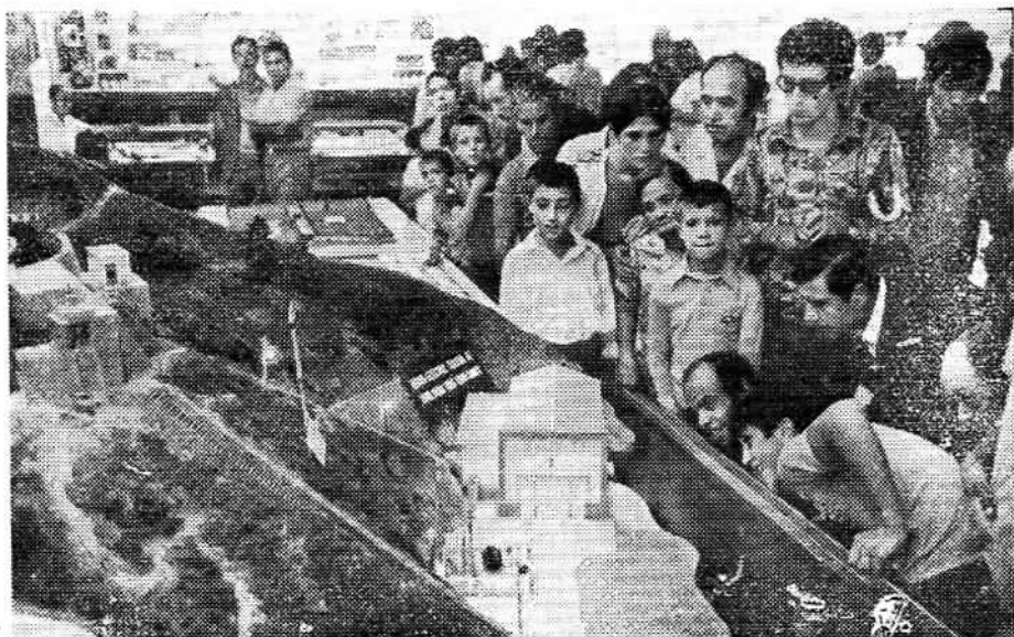
Model of a small rural power station at the Chinese Pavilion at Izmir.

Arriving in Japan on October 28 last year, "Kangkang" and "Lanlan" received an enthusiastic welcome from the Japanese people. Since their public appearance in the zoo on November 5, 1972, some 3.5 million people have come to see them, an average of 14,600 people a day since the pandas are not on show two days a week.