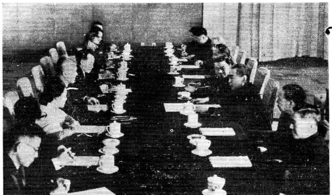
Premier Chou En-lai and President Nguyen Huu Tho hold talks.

The Republic of South Viet Nam side has given information on the situation in south Viet Nam since the signing of the Paris agreement, pointing out that violations of some vital provisions of the agreement by the United States and the Saigon administration have brought about a very grave situation in south Viet Nam. The Republic of South Viet Nam side reiterates