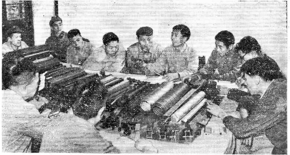
The mill's cadres, workers and technicians making a production plan.

Another user-factory had signed a contract with the mill for one type of shaped tube. Due to swift development, it soon changed its order to 31 types and specifications. In spite of the difficulties involved, the mill satisfied the factory's demand.